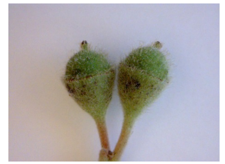
Capsule, sepals and hypanthium with scattered long whitish to rusty hairs