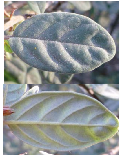
Leaves oblong to ± elliptic, mostly 1-3cm long, 6-15mm wide