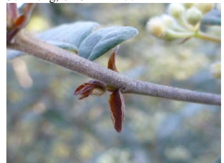
Stipules to c. 10mm long