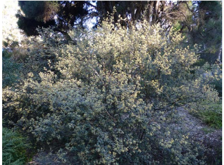
Australian National Botanic Gardens

Similar Species: P. subcapitata from which it differs in having stalked flowers in loosely arranged panicles rather than sessile flowers in compact clusters.