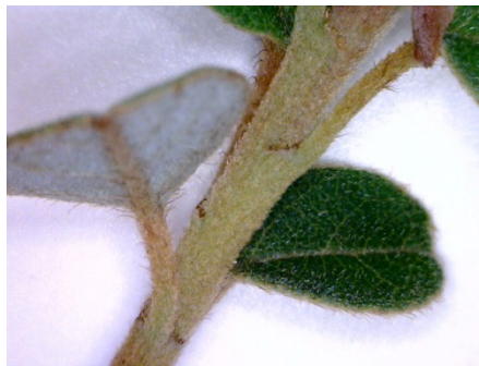
Young stems with spreading long rusty hairs