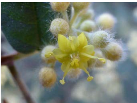
Buds with long whitish. Flowers pale yellow, in loose panicles