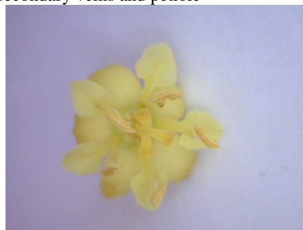
Petals usually present