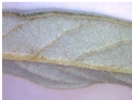
Lower surface sparsely scattered with long hairs, long hairs also prominent on secondary veins and petiole