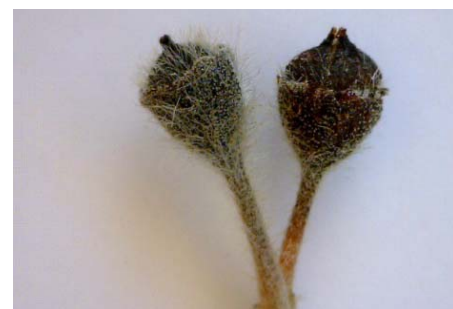
Capsule and hypanthium with long silky hairs