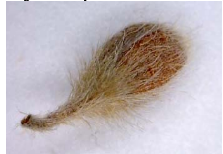
Buds with long silky hairs