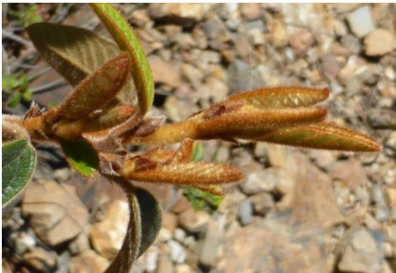
New growth rusty-hairy