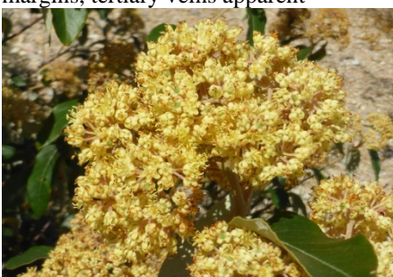
Flowers yellow, in terminal panicles 5-10 cm in diameter