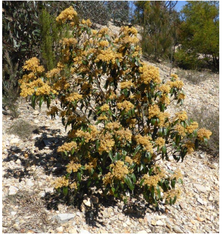
Cullulla Quarry Mayfield

Similar Species: P. lanigera from which it differs in having a glabrous leaf upper surface (rather than velvety with dense simple hairs) and lower surface with rusty hairs over a white tomentum (rather than only a few rusty hairs along the veins). P. ligustrina , from which it differs in having flowers with petals and usually smaller leaves.