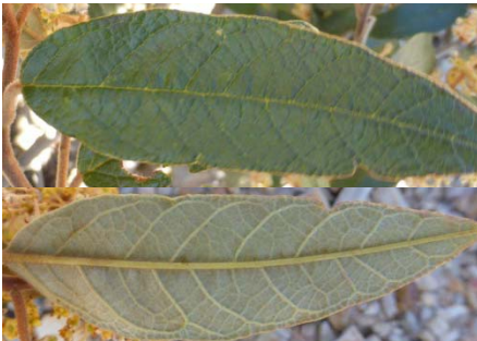
Leaves lanceolate to elliptic, 3-10cm long, 10-35mm wide, apex acute to obtuse; margins ± flat; upper surface glabrous and dull dark green; secondary veins regularly arranged, looping at the margins, tertiary veins apparent