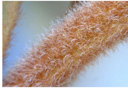
Stems rusty pubescent with spreading simple hairs