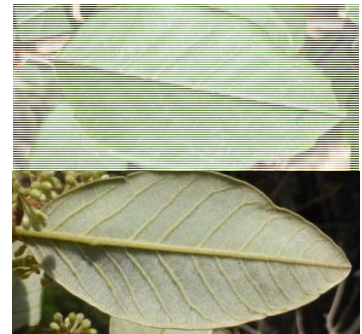
Leaves mostly ovate to broad-ovate or elliptic, 2-5cm long, 10-20mm wide, apex mostly obtuse. Upper surface glabrous