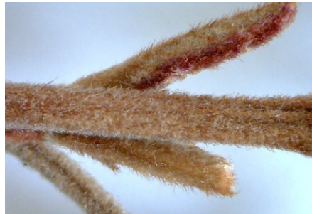
Simple hairs on young stems