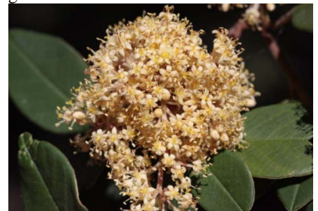
Flowers white, in dense pyramidal panicles