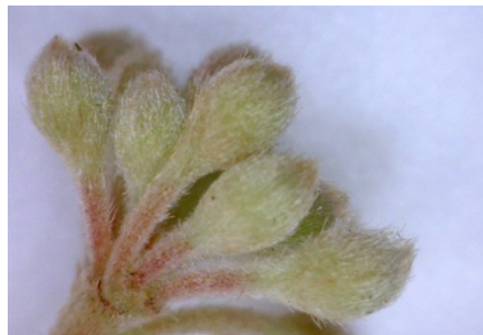
Buds with long whitish hairs.