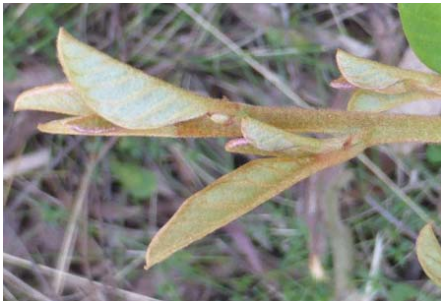
New growth and young stems covered with fawn to golden simple hairs