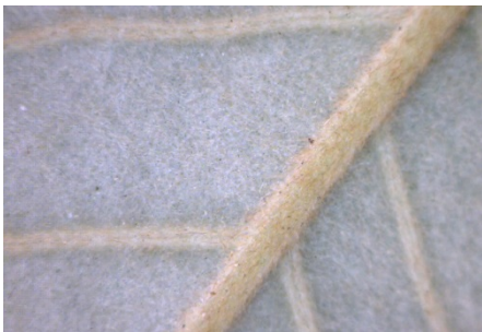
Leaf lower surface whitish tomentose, hairs curly, simple and mostly lying in the same direction. Secondary veins pale brown, regularly arranged and protruding above the hairy layer between the veins.