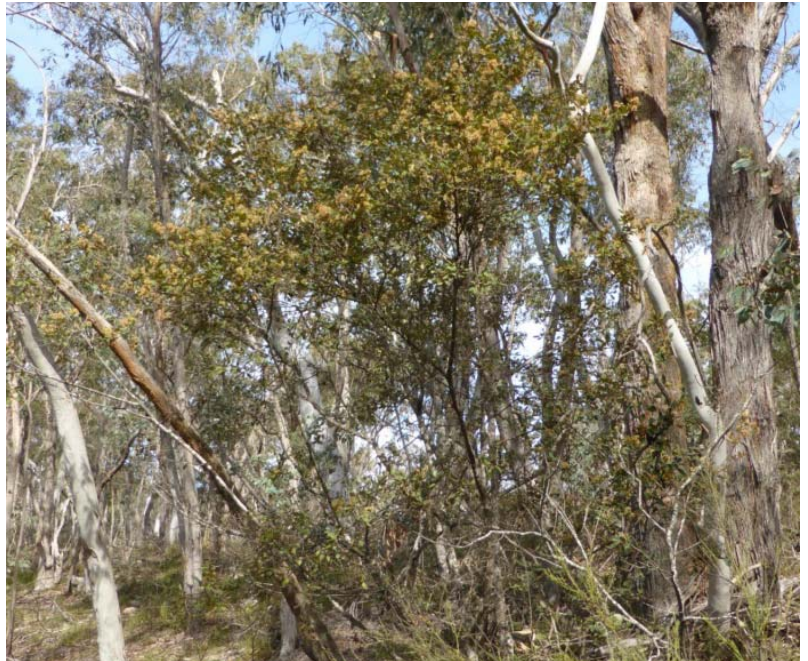
Mulloon Fire Trail

Similar Species: P. bodalla , from which it differs in having >6 pairs of secondary veins and dense simple hairs on young growth, forming an even distinctly rusty layer.