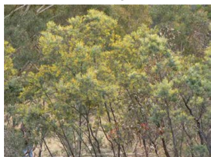
Acacia dealbata JG