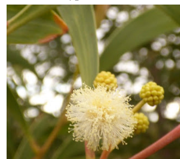
Acacia melanoxylon MB