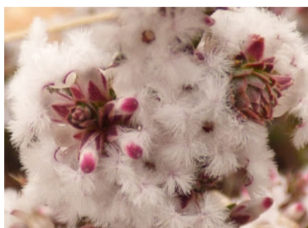
Leucopogon attenuatus MB