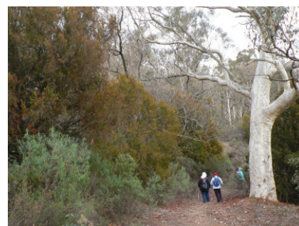
Eucalyptus rossii JG