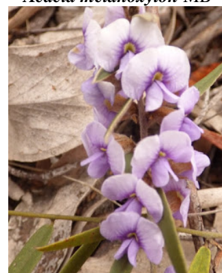
Hovea heterophylla MB