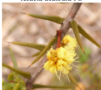
Acacia ulicifolia MB