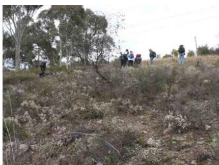
Hillside of Cryptandra sp. Floriferous & Leucopogon attenuatus JG

The walk was on the western side of Wanniasa Hills with great views to the Murrumbidgee Corridor and beyond. To return, we crossed under Erindale Drive and walked back on Farrer Ridge. We found great displays of Leucopogon attenuatus and Cryptandra sp. Floriferous (aka C. amara var. floribunda ) in full flower - hillsides of the L. attenuatus in fact. They gave off a lovely honey perfume. There were a few flowers on Acacia ulicifolia and A. gunnii and we saw the first Hovea heterophylla of the season, flowering, as well as Indigofera australis . As always, the trees were amazing - some very old Eucalyptus polyanthemos , some supporting big clumps of Amyema miquelii and a couple of Muellerina eucalyptoides on one. We added a few new species to our already long list - Arthropodium minus , Carex appressa , Glycine tabacina , Monotoca scoparia and Thelymitra sp. For images below JG = Jean Geue; MB = Martin Butterfield