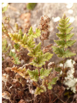
Cheilanthes distans MB