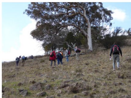
The Climb HB

Urambi Hills is part of Canberra Nature Park and is in the suburb of Kambah. This was only our second visit, starting from an entry point on Meredith Circuit. We did the steep climb to the trig point for great views then gradually made our way back along the western side. There was not a lot flowering but the interesting pea – Dillwynia sp. Yetholme – was flowering in a number of locations. Some extra species were added to our list - Astroloma humifusum , Cheilanthes sp., Chrysocephalum semipapposum , Daucus glochidiatus , Dianella revoluta , Drosera sp. and Hibbertia obtusifolia . For the images below FM = Fran Middleton, HB = Helen Brewer, JC = Janelle Chalker, JG = Jean Geue.