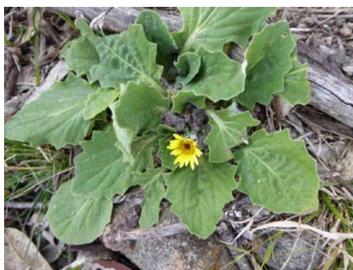
Cymbonotus lawsonianus JG