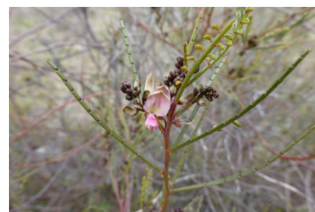
Indigofera adesmiifolia FM