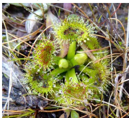
Drosera sp. JG