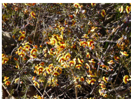
Dillwynia sp. Yetholme HB