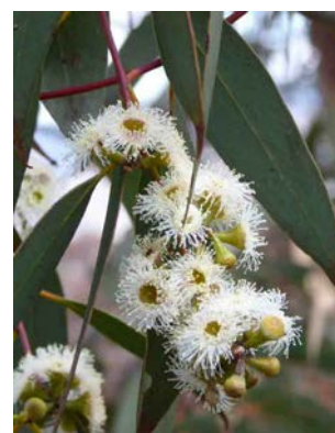
Eucalyptus pauciflora JG