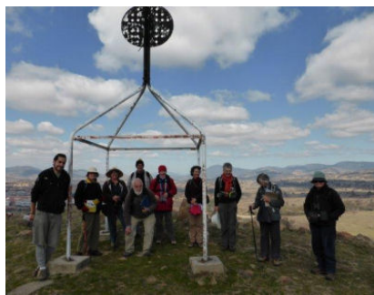
The Trig JC