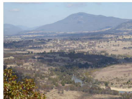
View from the top HB