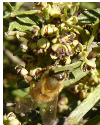
Dodonaea viscosa ssp. angustissima and bee