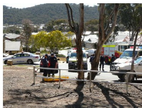
All services at Albizia Pl.