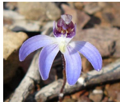
Cyanicula caerulea