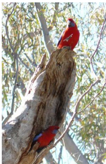
Crimson Rosellas