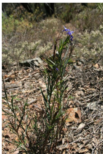
Stypandra glauca