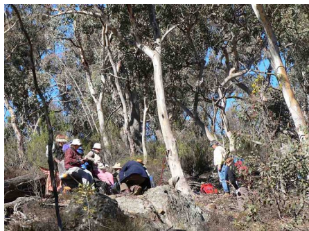
Morning tea part way up the ridge

Stringybark Reserve is to the east of the suburb Jerrabomberra, Queanbeyan NSW, and seems to be continuous with the bushland on Mt Jerrabomberra. It was our first visit and we started from Albizia Place. It is woodland with some stringybarks ( Eucalyptus macrorhyncha ) and also E. polyanthemos and E. rossii . We followed a path south before heading up to a ridge, following that north. There were some interesting plants that we don't often see – Stypandra glauca , Cryptandra amara var. floribunda , Phyllanthus hirtellus and Einadia hastata . There were good flower displays of Acacia pycnantha , A. dealbata , C. amara var. floribunda , Hovea heterophylla and Dodonaea viscosa ssp. angustissima . We also saw the first of the spring orchids – Cyanicula caerulea . Our walk was cut short by a medical emergency but it is worthy of a future visit.