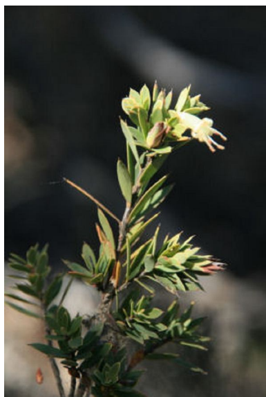
Stypelia triflora Image by Linda Spinaze