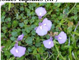
Utricularia dichotoma (RF)