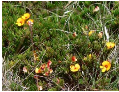
Dillwynia prostrata (JG)