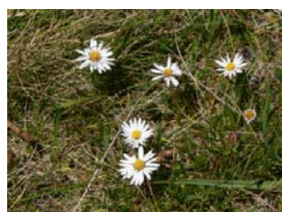
Brachyscome scapigera (JG)