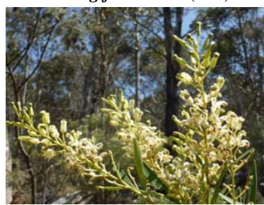
L. myricoides (RF)