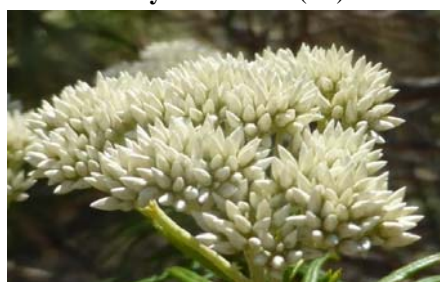
C. longifolia buds (MB)