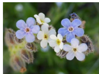
Cynoglossum australe (RF)