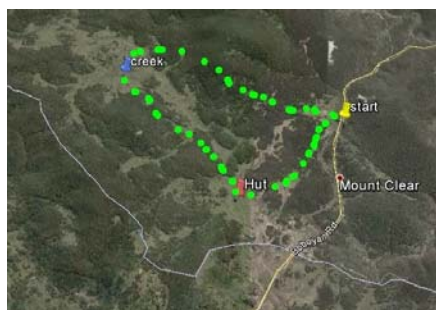
Map of our route