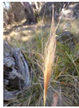
Dichelachne crinita (MB)