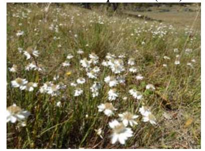
Rhodanthe anthemoides (RF)