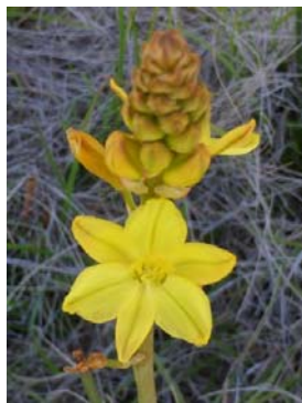
Bulbine glauca (RF)