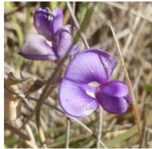
Swainsona behrii (MB)