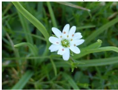
Stellaria angustifolia (RF)