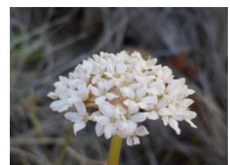
Trachymene humilis (RF)