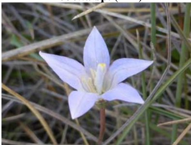
Wahlenbergia ceracea (RF)