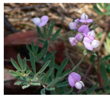
Lotus australis (JG)