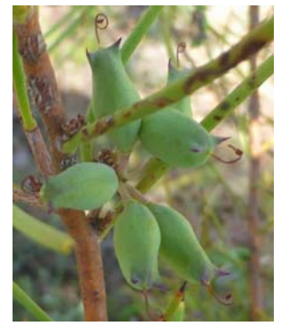
Hakea microcarpa fruit (MB)