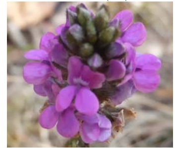
Cullen microcephalum (MB)