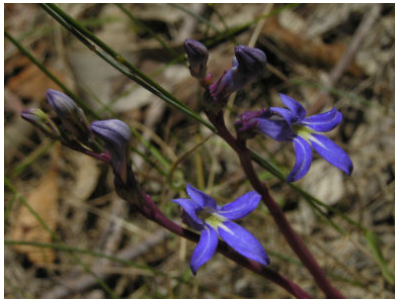
Lobelia sp.