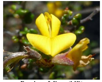
Bossiaea foliosa (MB)