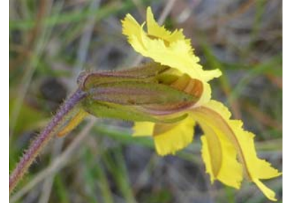
Velleia paradoxa showing spur at base of flower (RF)