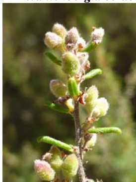
Pomaderris phyllicifolia ssp. ericoides capsules (RF)