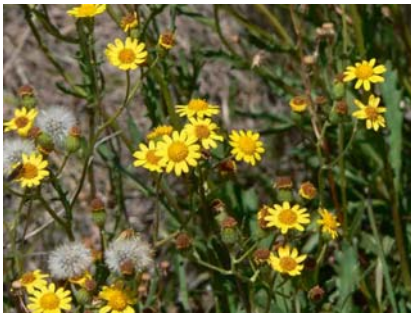
Senecio pinnatifolius var. alpinus (JG)