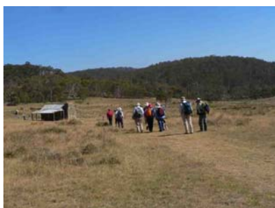
Brayshaw's Hut