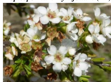
Baeckea utilis (MB)