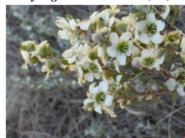
Leptospermum myrtifolium (RF)