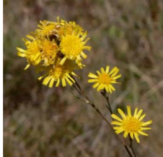
Podolepis hieracioides (JG)