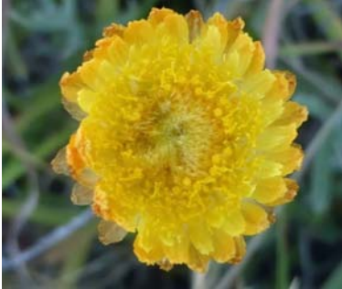
Helichrysum rutidolepis (MB)