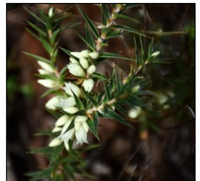
Scott Reserve - Acacia ulicifolia , Rt Melichrus urceolatus .