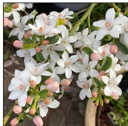
Philotheca 'Swanson's Hybrid'