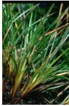
Schoenus calyptratus Totterdell C. ANBG) 1971 Kosciuszko National Park NSW, APII a.11418