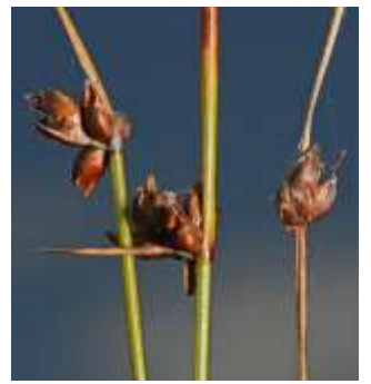
Schoenus nitens Photo J. R. Hosking 31 Dec 2010 ©The Royal Botanic Gardens & Domain Trust