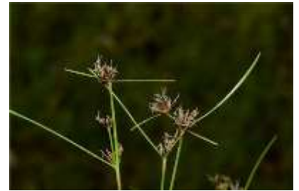
Schoenus apogon Fagg, M. 2016 Black Mountain Reserve, Canberra Nature Park, ACT, APII dig.46331