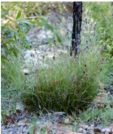
Schoenus villosus