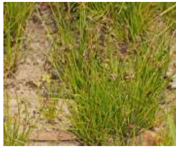
Schoenus apogon