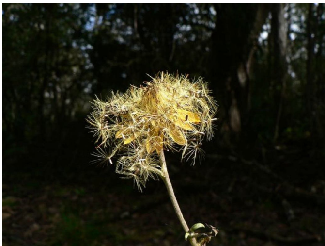
Xerochrysum bracteatum in seed