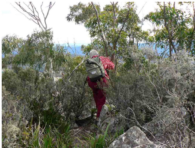
Near the trig with views to the east