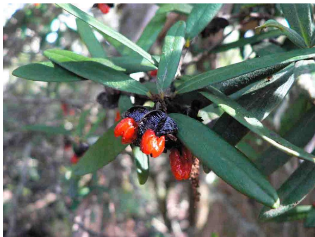
Pittosporum bicolor seed