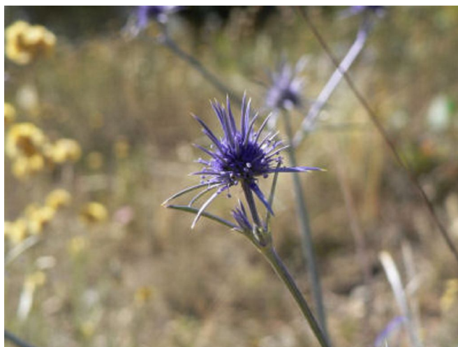
Eryngium rostratum