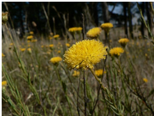
Rutidosia leptorhynchoides Image by Roger Farrow