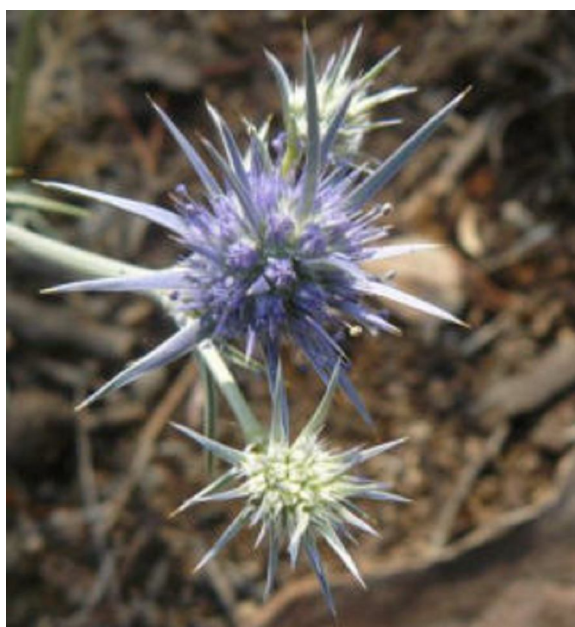
Eryngium rostratum