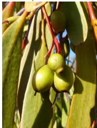
Amyema miquelii MB