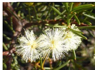
Acacia ulicifolia MB