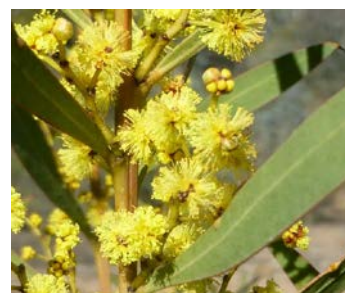
Acacia rubida MB