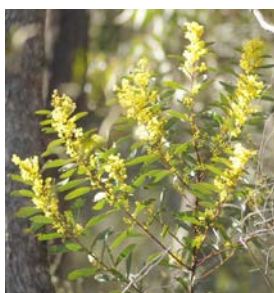
Acacia rubida