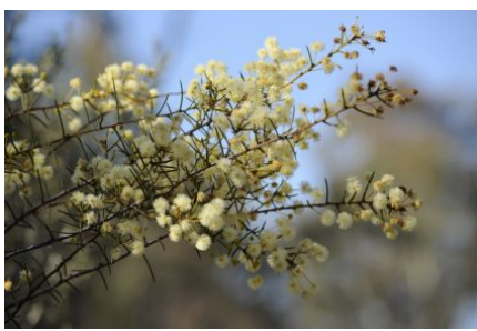
Acacia genistifolia DR