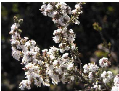
Leucopogon attenuatus JG