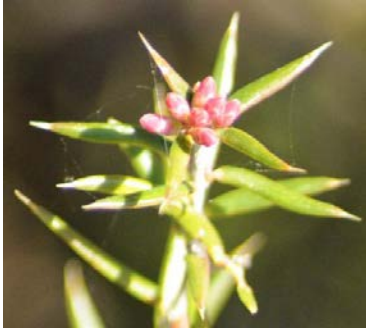
Lissanthe strigosa buds