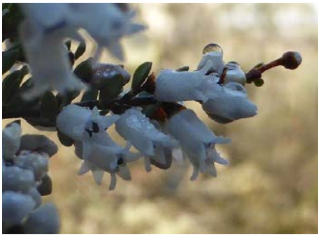
Cryptandra amara MB