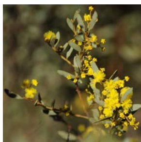
Acacia buxifolia