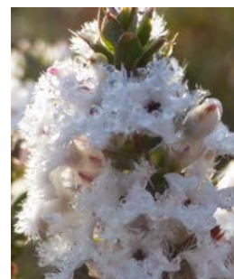
Leucopogon attenuatus MB