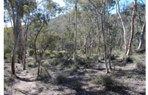
Likely to disappear under the new road BW