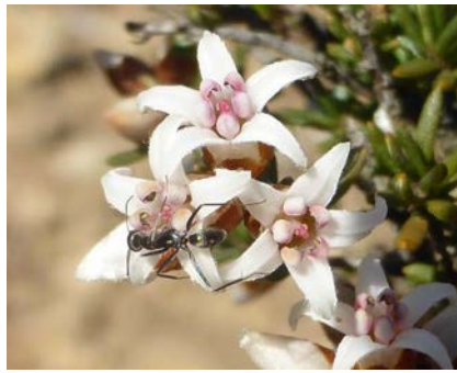
Cryptandra speciosa MB