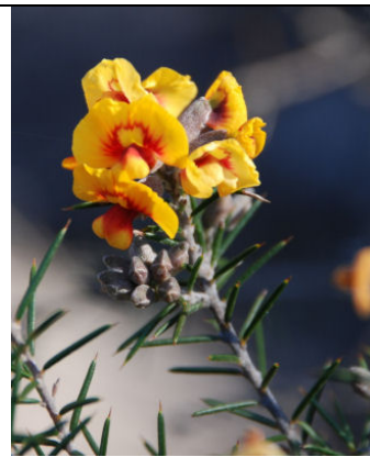
Dillwynia sieberi BW