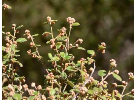
Pomaderris eriocephala JG