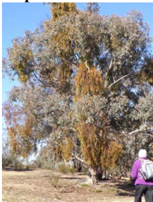
Eucalyptus polyanthemos with Amyema miquelii