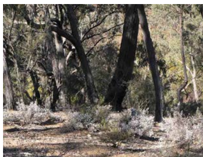
Understory of Leucopogon attenuatus JG