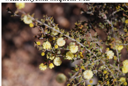
Acacia gunnii BW