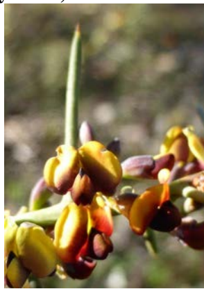
Daviesia genistifolia MB