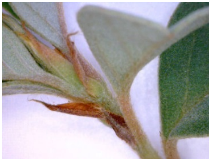
Stipules lanceolate - P. brogoensis