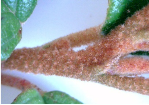
Rusty stellate hairs - P. prunifolia

Young stems \pm tomentose, hairs generally stellate or mixed with, or concealed by, longer simple hairs