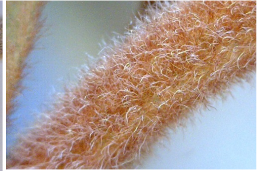
Pubescent with spreading simple hairs - P. ferruginea