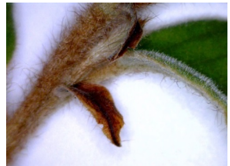
Stipules to c. 10mm long, falling early - P. subcapitata