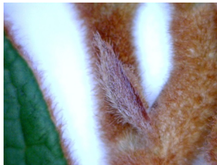
Stipules ovate to lanceolate, about 8mm long, shed early - P. ferruginea