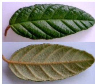
Secondary veins prominent on both surfaces, reaching the margins