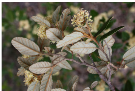
Leaves discolorous, secondary veins prominent on both surfaces, reaching the margins