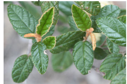
Leaves ovate to oblong to ± elliptic, 2-4cm long, 8-15mm wide. Apex broadly acute, margins ± toothed