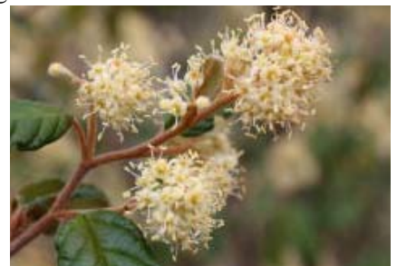
Flowers pale yellow – cream