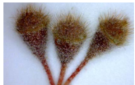
Capsule with long rusty hairs, hypanthium with whitish hairs