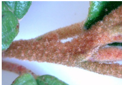
Stellate hairs on stems