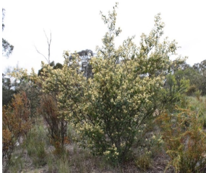
Carwoola Garden Specimen

Similar Species: P. betulina , from which it differs in having deciduous bracts and visible pedicels. All images are of a garden specimen.