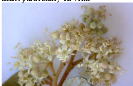
Flowers shortly pedicellate in short panicles