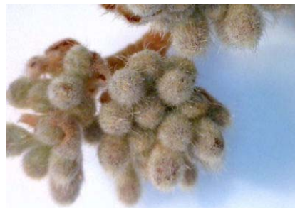
Buds with long whitish hairs