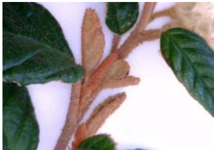
New growth with rusty stellate hairs