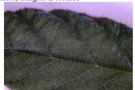
Leaf upper surface very wrinkled, scabrous with simple hairs, rarely ± glabrous.