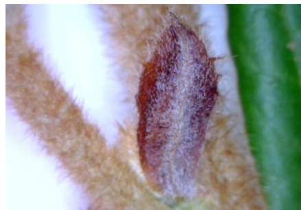
Stipules brown with white hairs falling early