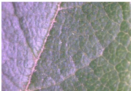
Leaf upper surface glabrous and dark green