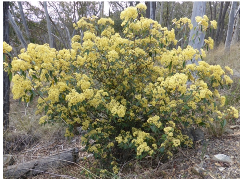
Black Mountain, ACT)

Similar Species: P. elliptica from which it differs in having simple hairs on the leaf undersurface (rather than short stellate hairs). P. lanigera from which it differs in not having reddish-brown young branches. Hybrids occur with P. elliptica and P. lanigera . P. ferruginea is also similar but has very rusty new shoots.