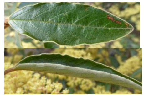
Leaves elliptic to ovate, 4-12cm long, 15-45mm wide, apex ± acute, sometimes folded, margins undulate; veins looping not reaching margins; tertiary veins distinct