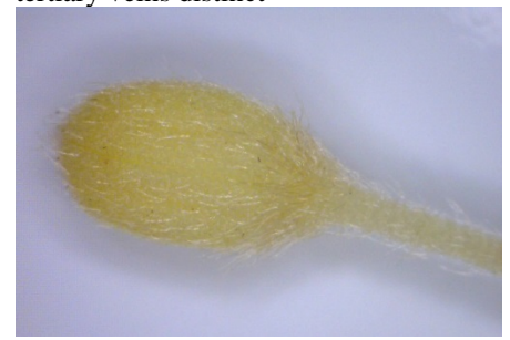
Buds with white simple hairs