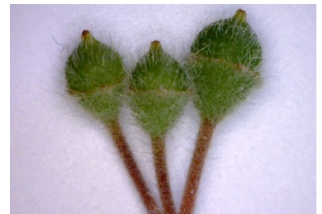
Capsule and hypanthium stellate-hairy, sparsely to densely tomentose with longer simple hairs