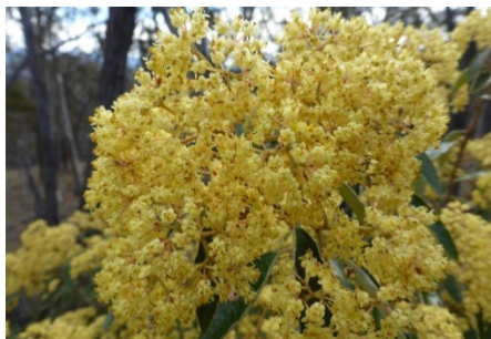
Flowers yellow, in corymbose panicles above the leaves