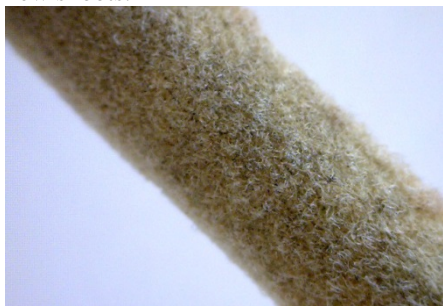
Stems with scattered longer simple or clustered hairs over a short whitish stellate tomentum