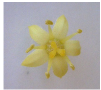
Petals absent – P. pallida

Capsules (dry dehiscent fruit) & Hypanthium (cup-like or tubular structure formed above the ovary with the stamens and perianth parts inserted on the rim)