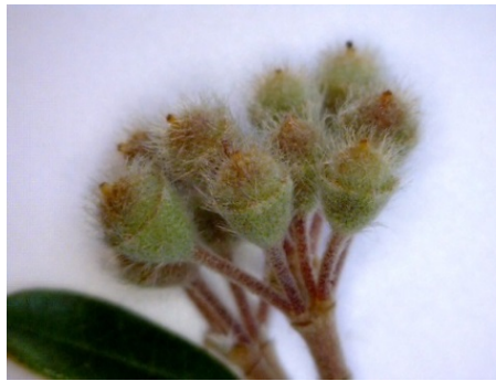
Capsule and hypanthium with long whitish hairs – P. andrmedifolia ssp. confusa