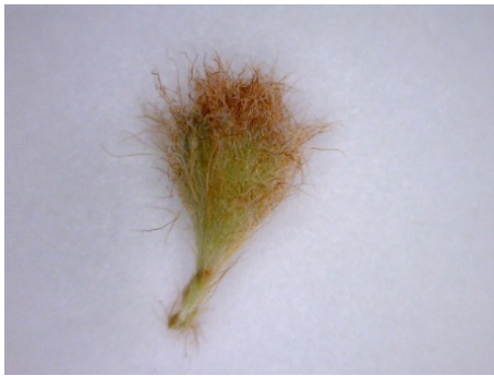
Capsule covered with long rusty hairs, hypanthium with fewer whitish hairs – P. eriocephala