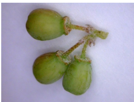
Capsules glabrous and almost entirely exserted from shortly tomentose hypanthium – P. angustifolia

Capsules (dry dehiscent fruit) & Hypanthium (cup-like or tubular structure formed above the ovary with the stamens and perianth parts inserted on the rim)