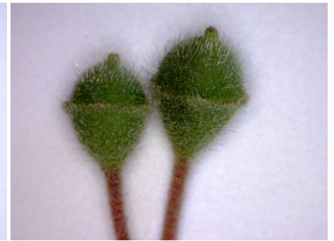
Capsule and hypanthium with long whitish hairs over a sparse tomentum – P. sp. 'Bungonia'