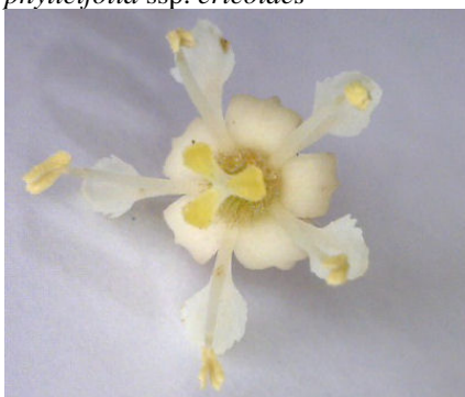
Flower with spatulate petals – P. andromedifolia ssp. confusa