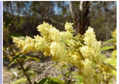
Flowers in loose elongated panicles – P. aspera