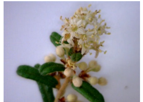
Flowers in leafy panicle – P. pauciflora