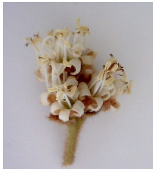
Flowers in compact head-like clusters – P. eriocephala