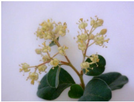
Flowers in terminal pyramidal panicles – P. brogoensis

Flowers – clustered in small cymes mostly grouped into terminal panicles or corymbs, sometimes in head-like clusters