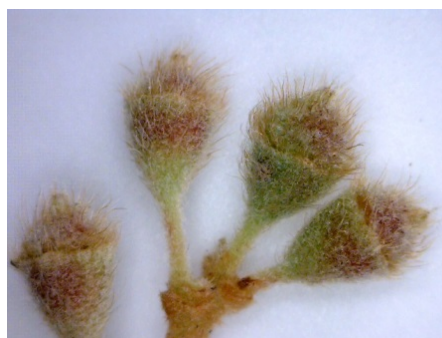
Capsule and hypanthium covered with long rusty hairs over a short whitish or greyish tomentum – P. betulina ssp. actensis