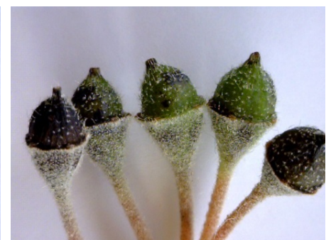
Capsule and hypanthium sparsely stellate-hairy, capsule sometimes almost glabrous – P. elliptica