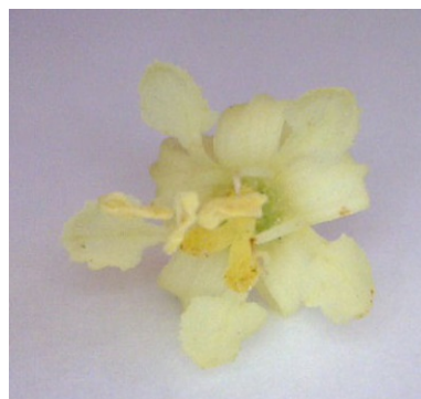
Petals auriculate – P. intermedia