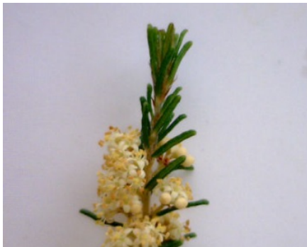
Flowers in short axillary cymes forming narrow terminal panicles – P. phyllicifolia ssp. ericoides