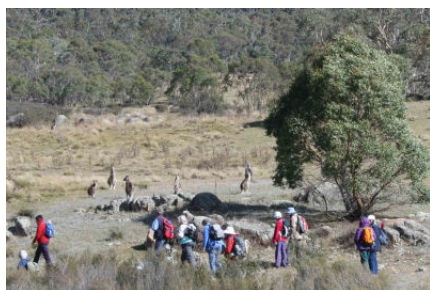
Out in the valley GRK