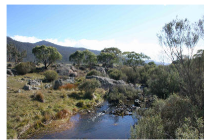
Orroral River GRK