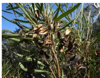
Lomatia myricoides pods