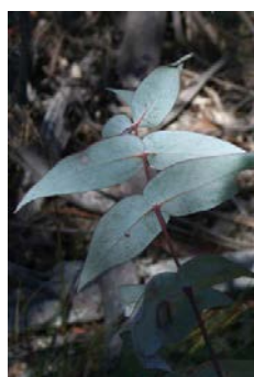
Eucalyptus dives juvenile leaves GRK