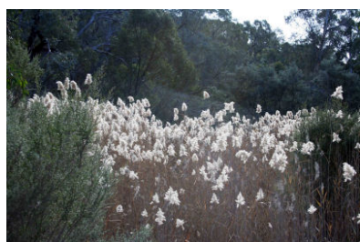
Phragmites australis GRK