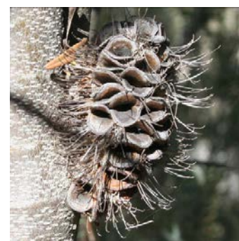
Banksia marginata GRK