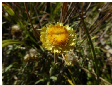
Coronidium gunnianum MR