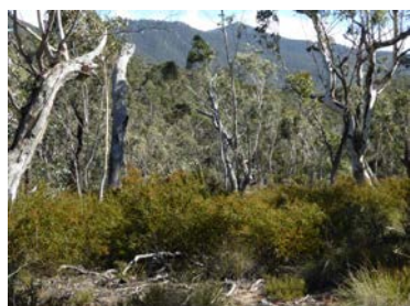
Acacia pravissima understory MR