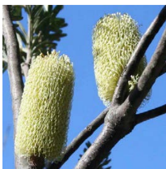
Banksia marginata GRK