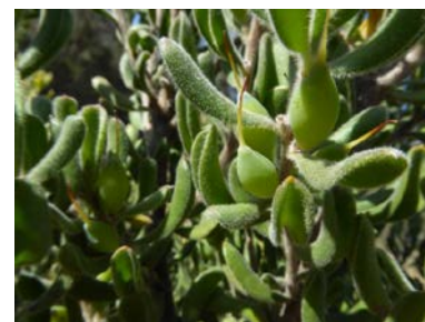
Persoonia rigida