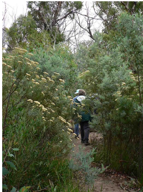
Regenerating undergrowth