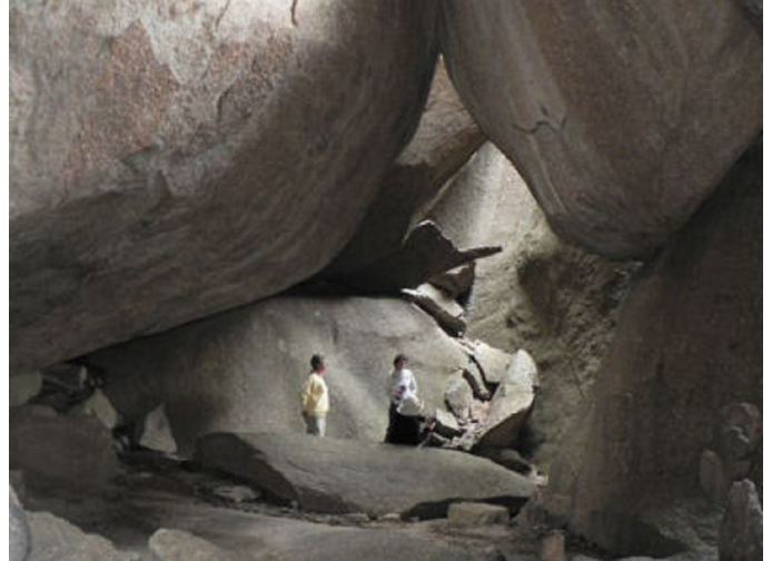
Cave among the boulders