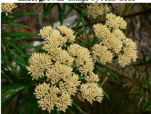
Cassinia longifolia