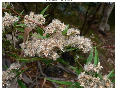
Ozothamnus stirlingii in seed