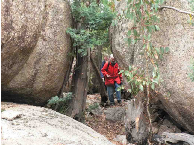
Granite boulders

Orroral Ridge Road (off Apollo Road) in Namadgi National Park climbs up to a ridge overlooking the Orroral Valley. There are spectacular granite boulders, excellent views, a cave to explore and easy walking through regenerating vegetation following the 2003 bushfires. We have been monitoring the regeneration on each visit and added a few extra species to our list this time. The highlight was seeing Lobelia denticulata in flower. Also flowering were Cassinia longifolia , Brachyscome rigidula , B. spathulata , Cynoglossum australe and C. suaveolens .