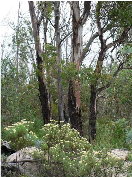
Eucalyptus viminalis and regenerating undergrowth