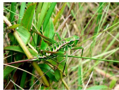
Chororodectes montanus