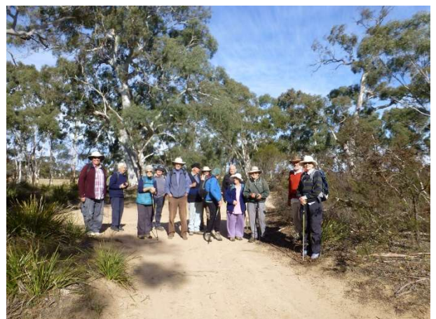
Wednesday Walkers setting out at Oallen Ford