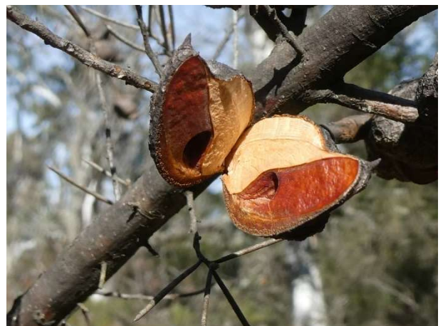
Hakea sericea open capsule