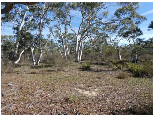
Typical dry forest Oallen Ford