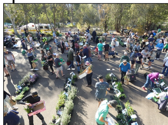
8.35am on Sale day Saturday.