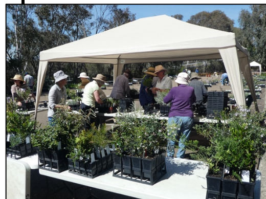
Set up Friday – plants arriving and being sorted.