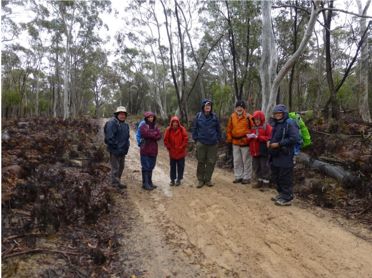
The intrepid walkers

Another chance to see Pomaderris even though the weather was terrible - high mud, deep wet sand... see below!