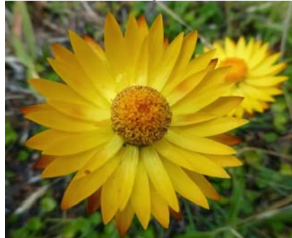
Xerochrysum subundulatum (MB)