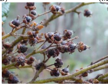
Pomaderris aspera capsules (RF)