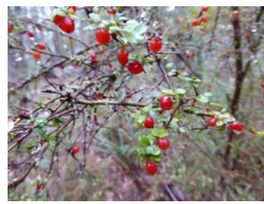
Coprosma quadrifida (MB)