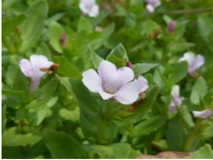
Gratiola peruviana (RF)