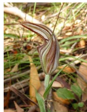
Diplodinium coccinum (RF)