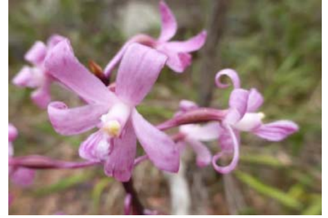
Dipodium roseum (MB)