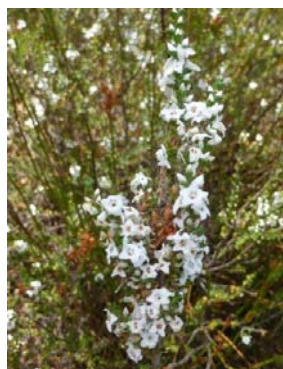
Epacris microphylla (RF)