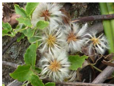
Clematis aristata (RF)