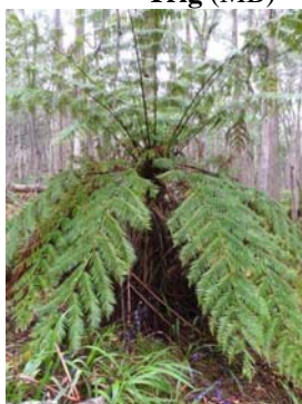
Cyathea australis (MB)