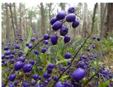
Dianella tasmanica (RF)