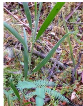
Acacia melanoxylon (MB)