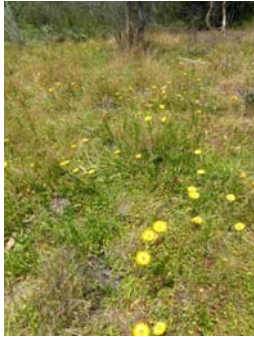
Xerochrysum subundulatum throughout swamp (MB)