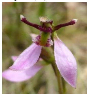
Eriochilus magenteus (MB)