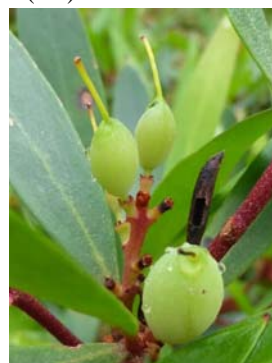
Persoonia silvatica berries (MB)