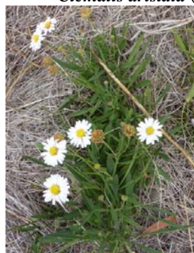
Brachyscome scapigera (RF)