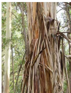
Eucalyptus viminalis bark (MB)