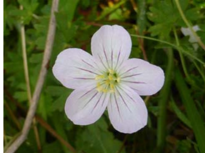
Geranium neglectum (RF)