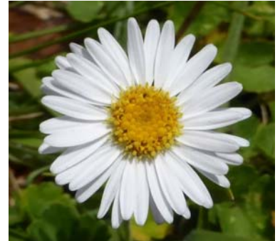
Brachyscome graminea (MB)