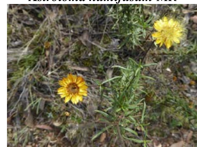
Xerochrysum viscosum MR