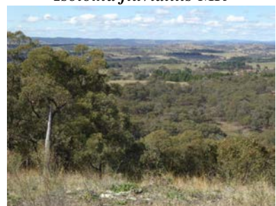
View from the top MR