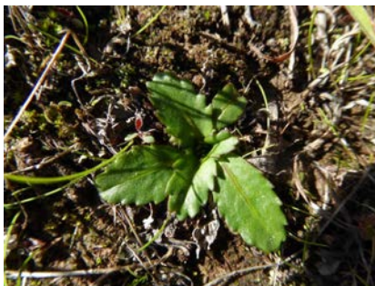
Solenogyne dominii appearing MR