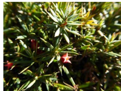
Astroloma humifusum