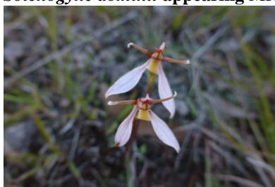
Eriochilus cucullatus FM