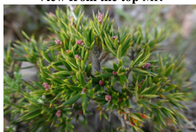
Lissanthe strigosa FM