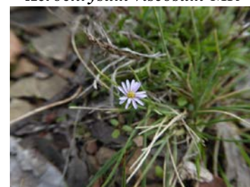
Vittadinia muelleri MR