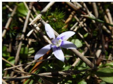
Isotoma fluviatilis MR