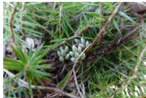
Acrotriche serrulata FM