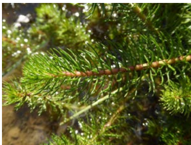
Myriophyllum sp. MR