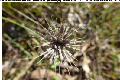
Oreomyrrhis eriopoda FM