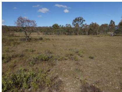
Grassland merging into woodland MR

We began the walk from the entrance at the end of the new suburb of Bonner, on Mulligans Flat Road. It is mainly open woodland with some grassland. We walked north through the grassland before heading west and up the hill for lunch with a view. We were able to have a lot of practice IDing plants without flowers - some were a bit challenging. Many things were re-appearing such as Craspedia variabilis and Leptorhynchos squamatus . Melichrus urceolatus was flowering and there was the odd flower on Vittadinia muelleri , Goodenia hederacea , Chrysocephalum semipapposum and Hypoxis hygrometrica and many buds on Cryptandra amara and Leucopogon fletcheri ssp. brevisepalus . It was nice wandering from grassland to woodland and seeing the change in species. The views from the top were fantastic. For the images below FM =Fran Middleton, MR = Masumi Robertson.