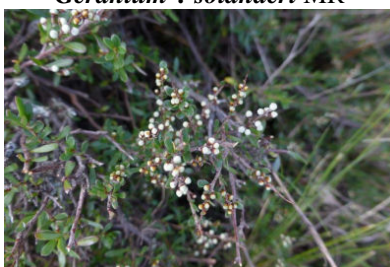
Cryptandra amara FM