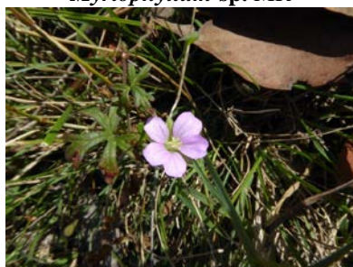
Geranium ? solanderi