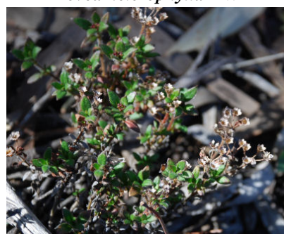
Pomax umbellata in bud & old flowers BW