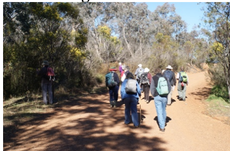
Starting off DH