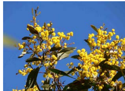
Acacia rubida JG