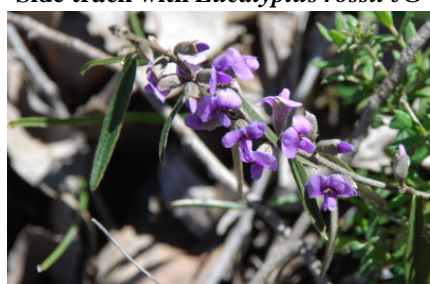
Hovea heterophylla BW