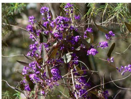
Hardenbergia violacea