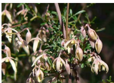
Clematis leptophylla JG