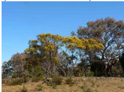
Acacia rubida JG