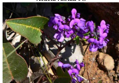
Hardenbergia violacea