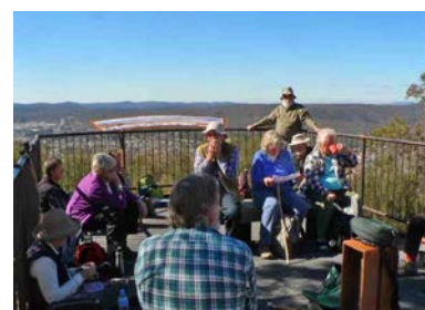
New lookout JG