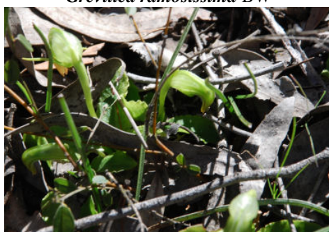
Pterostylis nutans BW