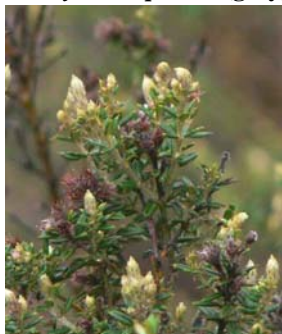
Oxylobium ellipticum JG