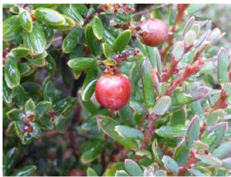
Acrothamnus hookeri RF