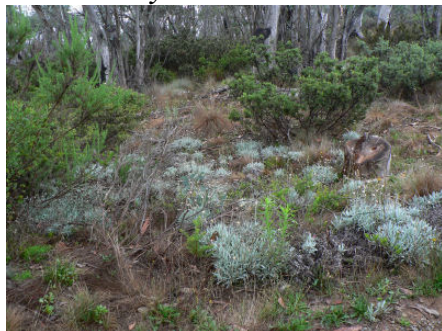
Leucochrysum alpinum (grey) JG