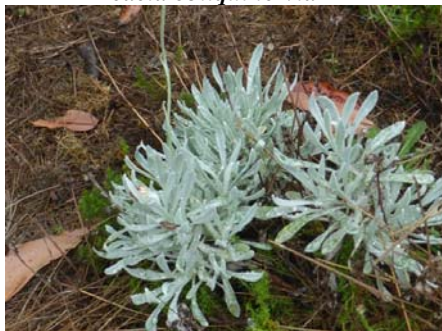
Leucochrysum alpinum RF