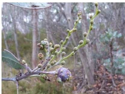
Acacia obliquinervia RF