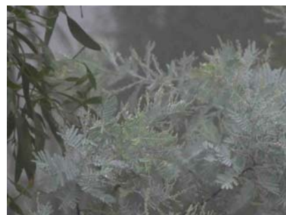
Acacia dealbata JG