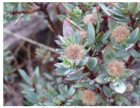
Pimelea glauca RF