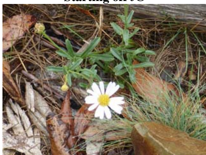
Brachyscome aculeata RF