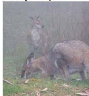
Natives in the clouds MB