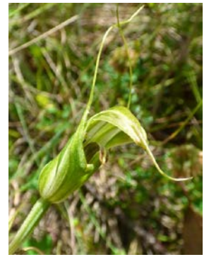
Diplodinium aestivum MB