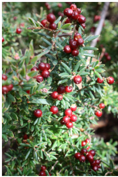
Acrothamnus hookeri JW