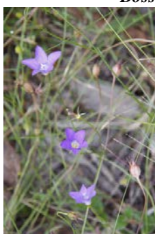
Wahlenbergia stricta LS