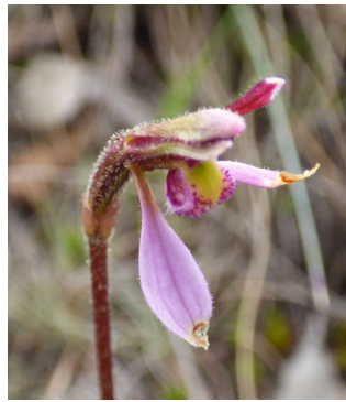
Eriochilus magenteus MB