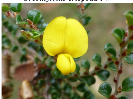
Bossiaea foliosa RF