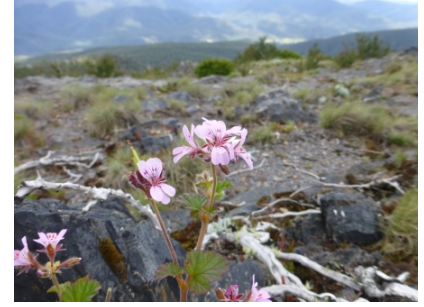
Pelargonium australe RF