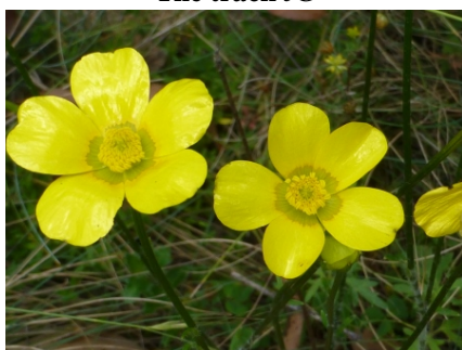
Ranunculus lappaceus RF