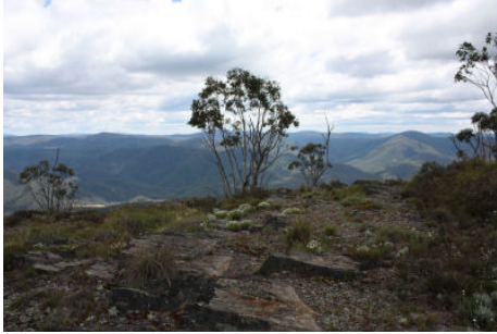
Lunch view JW