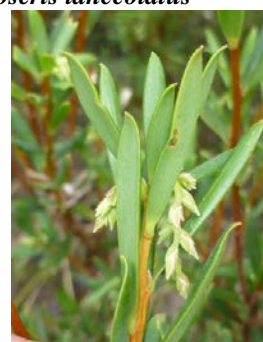
Leucopogon gelidus RF