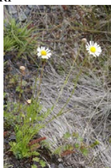
Brachyscome diversifolia LS