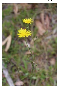
Picris angustifolia LS