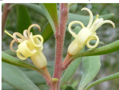
Persoonia subvelutina RF