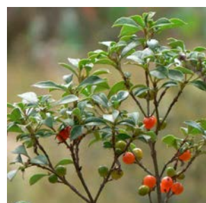
Coprosma hirtella JG