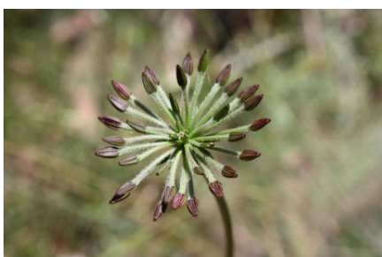
Oreomyrrhis eriopoda JW