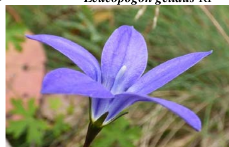
Wahlenbergia gloriosa MB