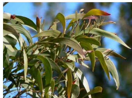
Acacia implexa leaves JG