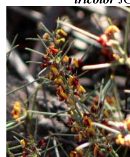
Daviesia genistifolia