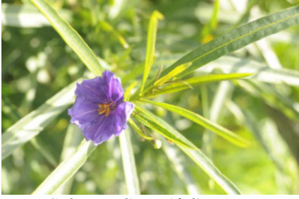
Solanum linearifolium