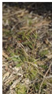
Austrostipa scabra ssp. falcata