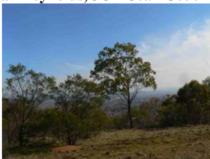
Acacia implexa JG