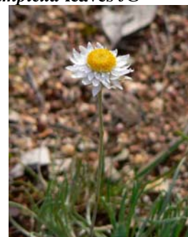
Leucochrysum albicans var. tricolor JG