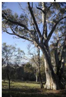
Eucalyptus rossii