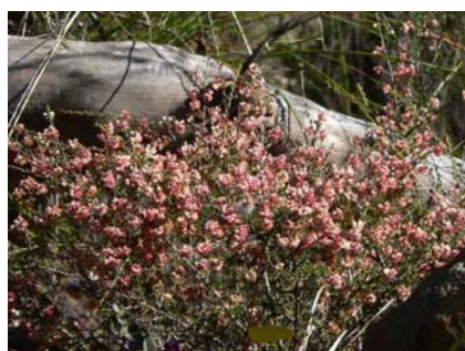
Cryptandra amara var. floribunda