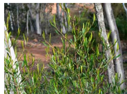
Dodonaea viscosa ssp. angustissima JG