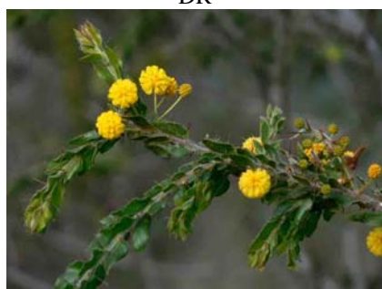
Acacia paradoxa JG