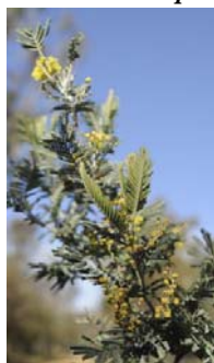
Acacia dealbata