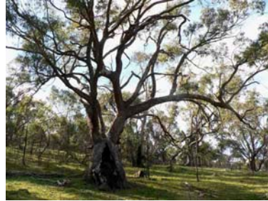
Eucalyptus bridgesiana JG