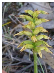
Corunastylis apostasioides RF