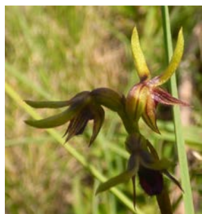
Corunastylis oligantha MB