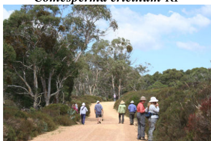
Half Moon Creek Road GRK