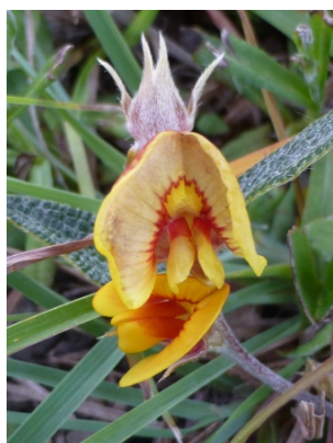
Mirbelia platylobioides RF