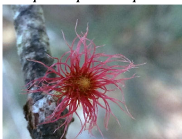
Allocasuarina littoralis (female) GRK