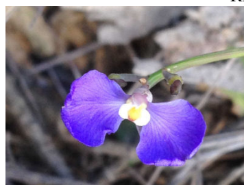
Comesperma sphaerocarpum GRK