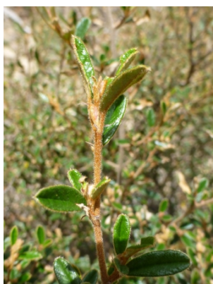
Pomaderris pauciflora RF