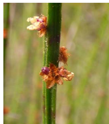
Amperea xiphoclada MB