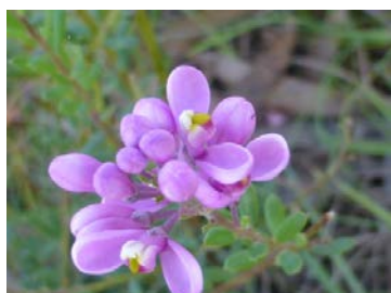
Comesperma ericinum RF