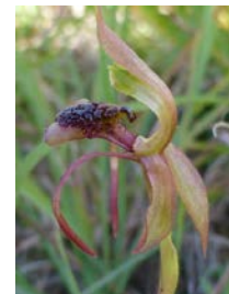
Chiloglottis reflexa RF