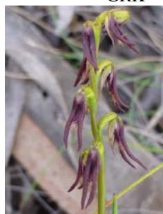
Corunastylis ostrina RF