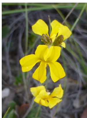
Goodenia bellidifolia RF