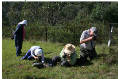
Snappers at Mongarlowe Cemetery GRK