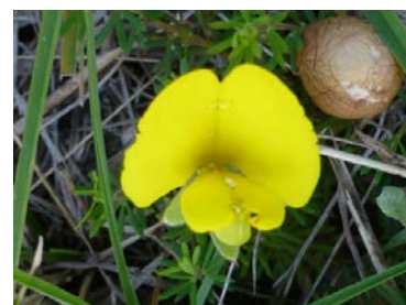
Gompholobium minus RF