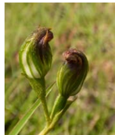
Speculantha sp. MB