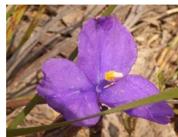
Patersonia sericea MB