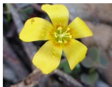
Oxalis exilis MB