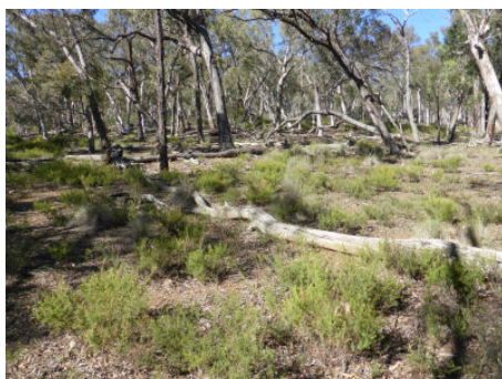
Pultenaea setulosa & Eucalyptus macrorhyncha habitat RF