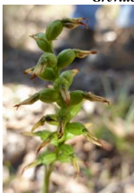
Corunastylis sp. MB