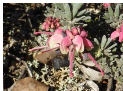
Grevillea lanigera RF