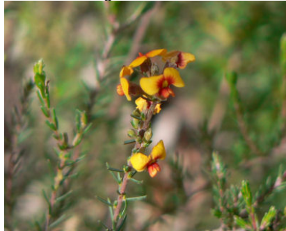
Dillwynia sericea JG