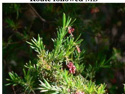
Hybrid grevillea JG