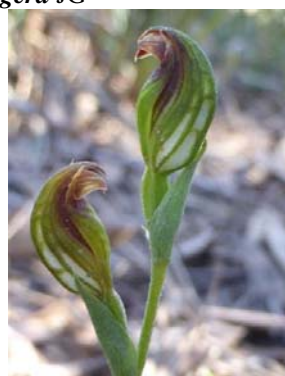
Speculantha rubescens RF