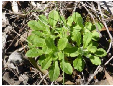
Wahlenbergia stricta rosettes RF