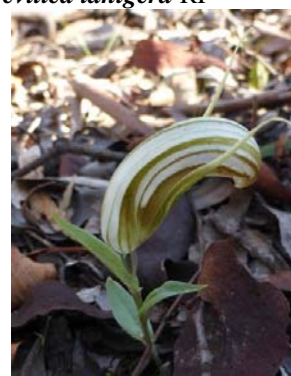
Diplodium truncatum RF