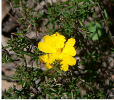
Hibbertia calycina JG