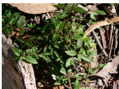
Opercularia hispida