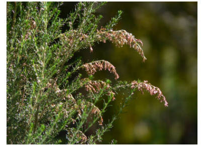
Cassinia arcuata JG