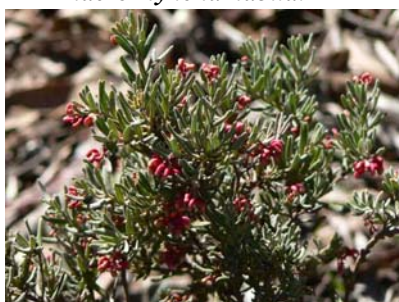
Grevillea lanigera JG