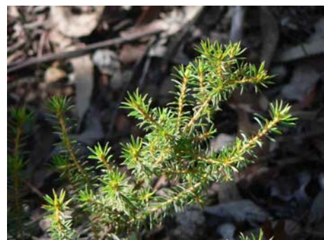
Pultenaea setulosa JG