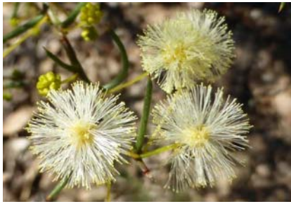
Acacia genistifolia MB