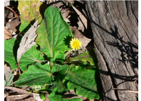
Cymbonotus lawsonianus JG