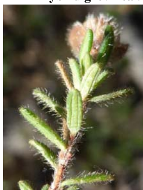
Hibbertia calycina RF (note in-rolled edges of leaf higher than mid-vein)