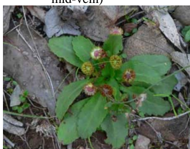
Solenogyne dominii JG