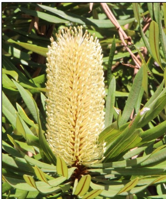
Banksia aquilonia is a tree to 8 metres tall, with long green leaves and young tan flowers that develop into pale yellow brushes. This plant is native to northern coastal Queensland.

Text by Ros Walcott and photos by Ben Walcott.