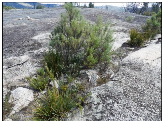
A 'garden' and a skink on the granite rocks on the Booroomba to Honeysuckle WW walk.