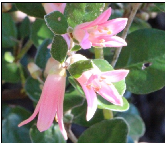
Correa 'Catie Bec' is a small shrub with curled pink flowers over a long period. This plant, developed at Bywong Nursery by Peter Ollerenshaw, grows in a wide range of soil types and is frost hardy and drought tolerant.