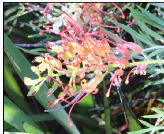
Grevillea 'Mason's Hybrid', is a spreading bush with large spider blooms of pink, red and orange. This hybrid arose from seed collected from an upright glaucous form of Grevillea bipinnatifida while the other parent is presumed to be G. banksii .