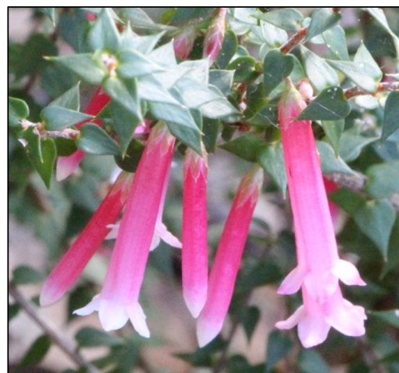
Epacris longiflora 'Nectar Pink', a very floriferous small shrub covered in slender pink bells with white tips.