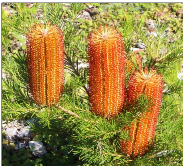
Banksia ericifolia 'Bird Song', a small banksia with fine, bright green foliage and large orange brushes.