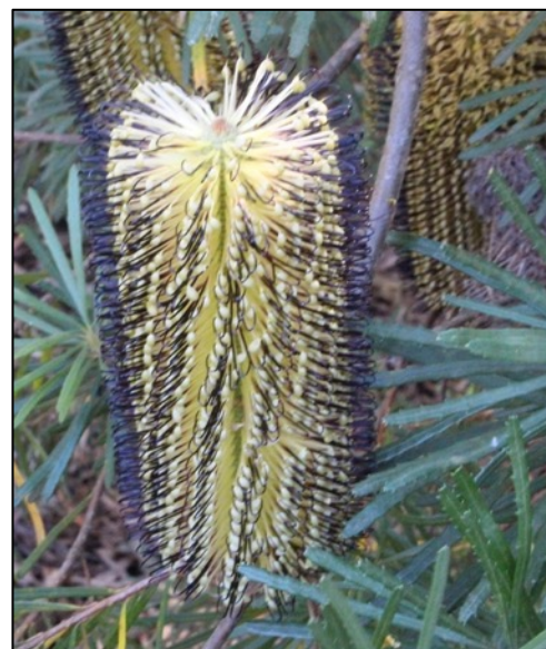
Banksia spinulosa var. cunninghamiana , a small tree with dull gold flowers with black styles, native to the three eastern states extending along the coast from Victoria to Cairns.