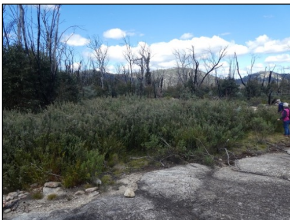
On the Booroomba to Honeysuckle WW walk - recovery after fire. Lt Oxylobium ellipticum, Rt Blackened trunks, epicormic growth.

For further information, please contact president@nativeplantscanberra.com.au in the first instance.