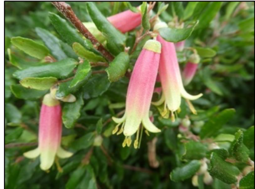
Correa sp.