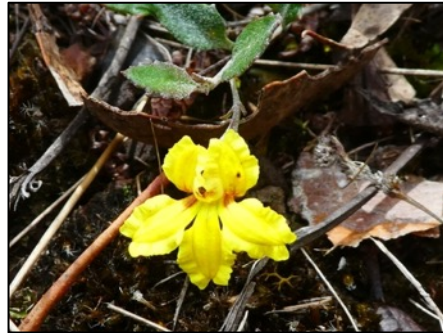
At Dalton – Goodenia hederacea, looking at the orchids, Eriochilus cucullatus - Parson's Bands.