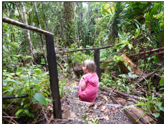
Jean's granddaughter amongst the scrambling dense vegetation of the Waisali Rain Forest Reserve.

Growing up on the edge of Exmoor in Somerset, England, gave Jean an interest in native plants from a very young age. When moving to Aranda in the late 1960s with Black Mountain on her doorstep she soon discovered native orchids and was hooked. She has travelled many countries in her quest for orchids including Spain, Peru, Borneo, Ireland, and China, also living in Fiji for a year (1998/99).