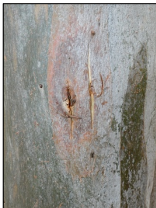
Eucalyptus sp bark.

The 2022 Winner was the mighty Mountain Ash - Eucalyptus regnans.