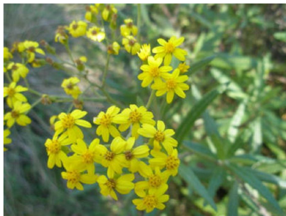
Senecio linearifolius