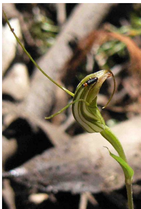
Diplodinium ? decurvum Image by Jean Geue