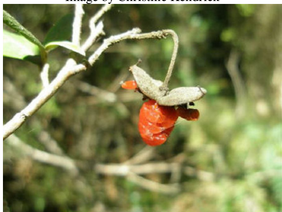
Pittosporum bicolor fruit