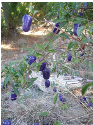
Billardiera longiflora