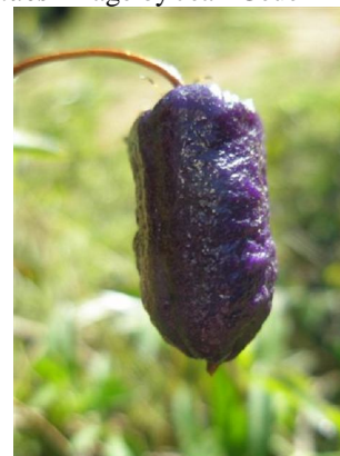
Fruit of Billardiera longiflora