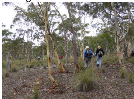
Grassy Box Woodland

For images below: = Jean Geue, MB = Martin Butterfield, RF = Roger Farrow