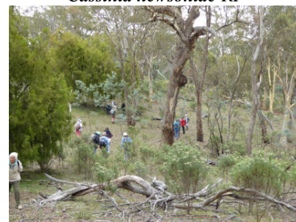
Travelling Stock Reserve JG