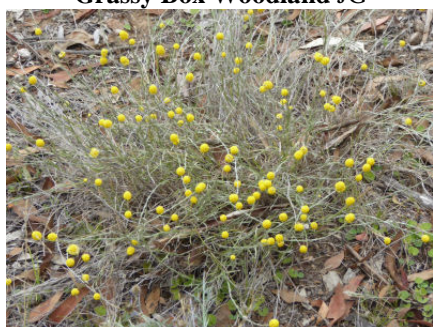
Calocephalus citreus JG