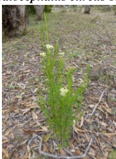
Cassinia hewsoniae RF