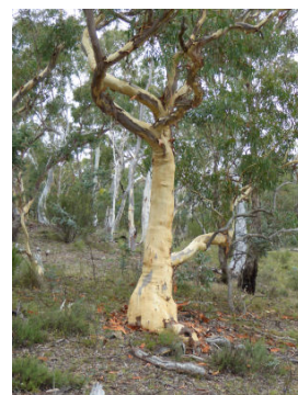
Eucalyptus rossii JG