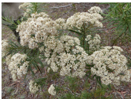
Cassinia longifolia JG