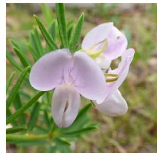
Lotus australis MB