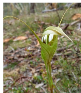
Diplodinium decurvum MB