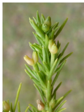
Scleranthus biflorus (loose form) RF