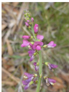
Desmodium brachypodum RF