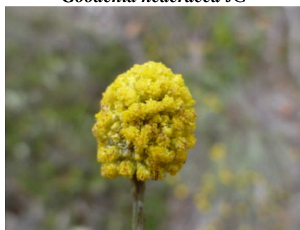
Calocephalus citreus RF