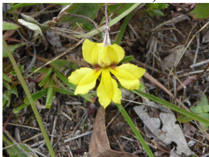
Goodenia hederacea JG