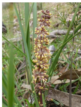
Lomandra multiflora RF