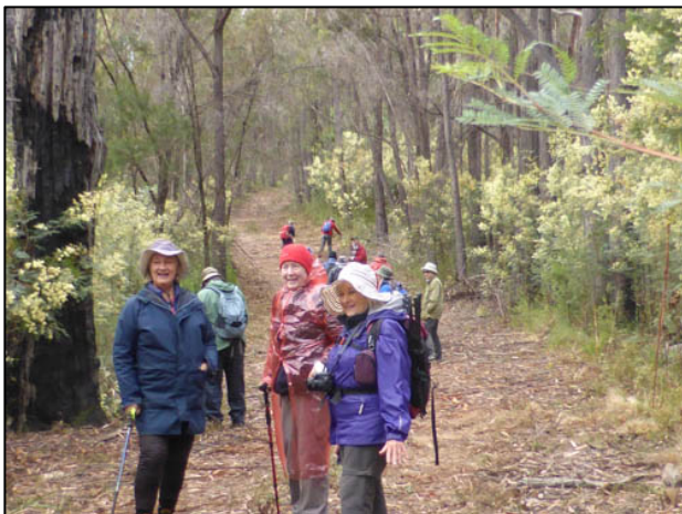
Forest ridge track with Acacia terminalis .