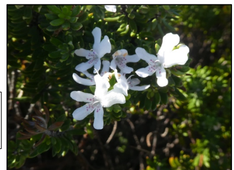
Westringia fruticosa at Green Cape.

*Australian Native Plants Society Australia