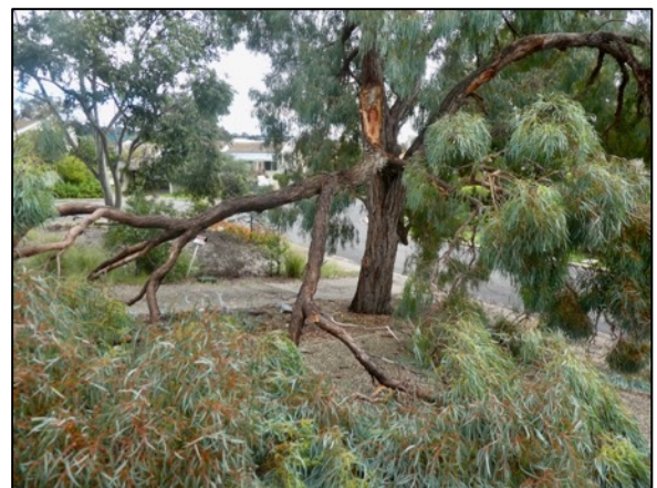
Above: damaged Eucalyptus nicholii in front garden. Below: training plants using the Japanese 'Niwak' method.