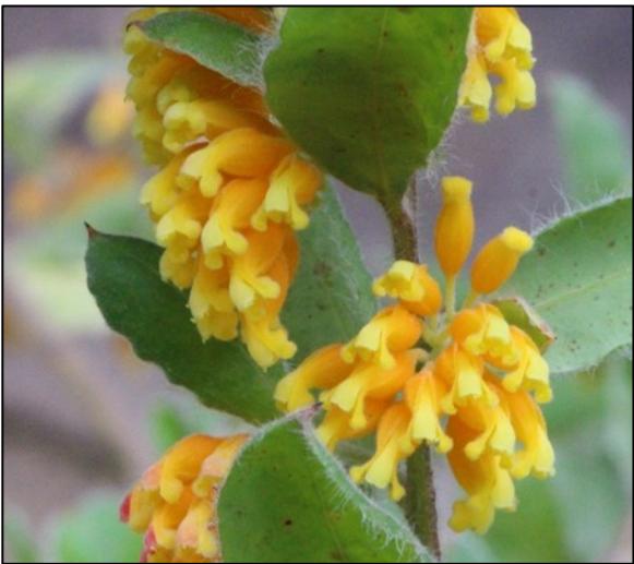
Grevillea pimelioides We planted this erect shrub, 2.5m high, with red tipped, hard yellow flowers in a pot in September 2010. This plant is native to the Helena and Canning River regions southeast of Perth, WA. We transplanted our specimen to a large pot in February 2012 and cut it back quite severely. Our original plant died in December 2016 and we planted another in July 2020.