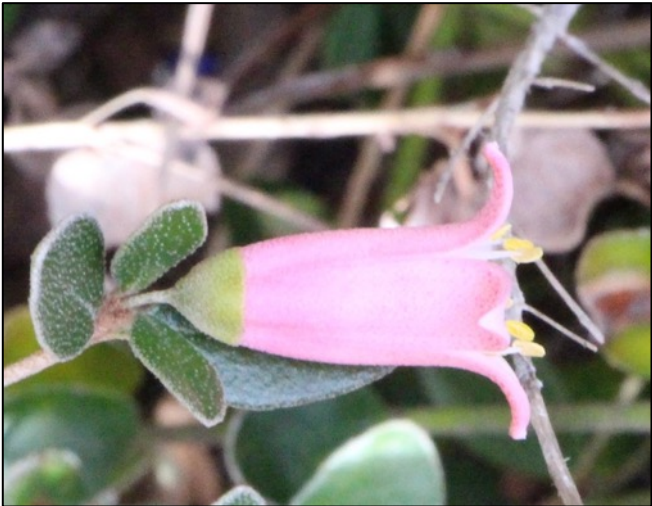
Correa ‘Isabell’ We have planted 17 of these small spreading shrubs, which grow to 75cm high, with grey-green leaves and soft pink flowers, from 2017-21. This Bywong Nursery selection definitely needs overhead protection in our garden and most of our plants have succumbed to sun and frost.