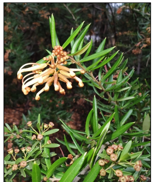
Lyndal Thorburn photo - Grevillea 'Apricot Glow' in Lyndal's garden

https://the-riotact.com/anu-expert-says-eucalyptus-trees-arent-the-widow-makers-we-might-think/669089