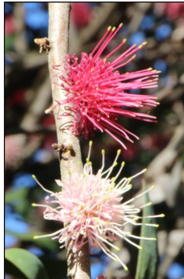
Hakea obtusa is a small tree with leathery foliage and dark pink powderpuff flowers along the stems. This plant is native to the southwestern coast of Western Australia.