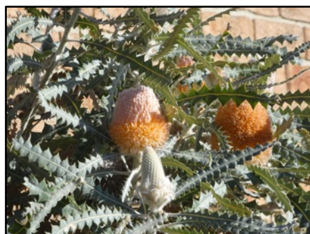
Mark and Cathy Dearnley's garden

The owners knew nothing about gardening before arriving in Australia but soon became enthralled by Australian coastal landscapes with their windswept vegetation and later by dry inland landscapes with their sparse beauty and sun-bleached colours. These landscapes have inspired their native garden. The pebble mulch used throughout was quite unusual and, according to Mark, very successful at suppressing weeds while permitting rapid infiltration of rain.