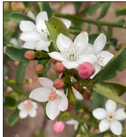
Philotheca 'Swanson's Choice' flowering in June in Bill Willis' garden.

The Conservation Council ACT Region has launched an ACT Legislative Assembly e-petition to have the area given Nature Reserve status to protect its biodiversity values as it is under threat from encroaching urban development.