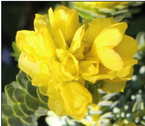
Geleznowia verrucosa has close grey-green foliage and bright yellow terminal flowers. This genus was defined by Ukrainian-Russian botanist Nicolai Stepanovitch Turczaninow in 1849 and its only species, Geleznowia verrucosa , is native to the west coast of Western Australia north of Perth.