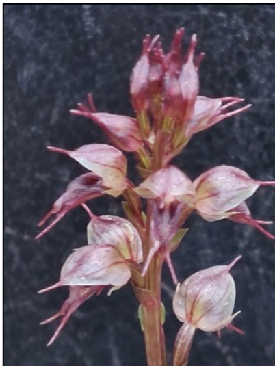
Acianthus collinus, Hooded Mosquito-Orchid, on WW at Bango NR on 15 June.