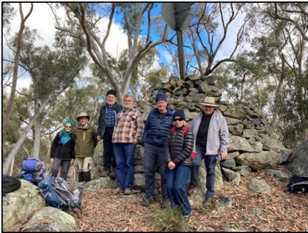
WWers at Bango NR.

To receive emails about future WWs, register your interest in your membership record in the members area on our website.