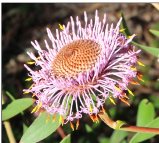
Isopogon cuneatus , growing in a pot, is an upright shrub with floppy branches of flat bright green leaves, often tinged with red, and large pink heads of drumstick flowers. This plant is native to southwestern Western Australia.