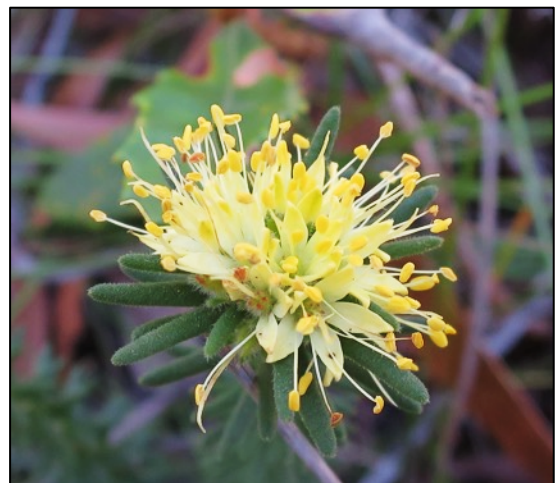
Field trippers at Barren Grounds NR & plants at Robertson Rainforest NR Leionema diosmium.