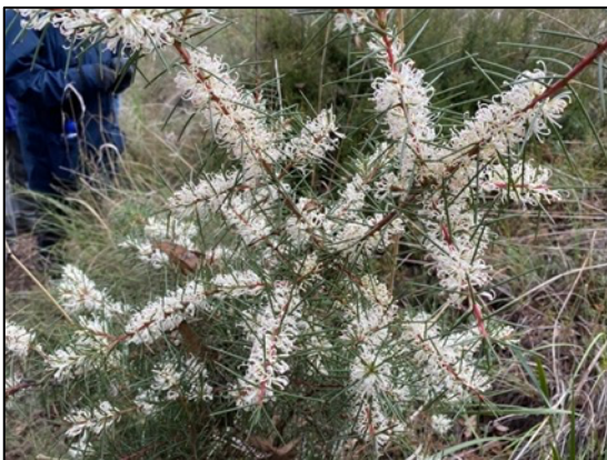
Hakea decurrens - Needlewood, Mt Jerrabomberra in June.

The WW group decide where they wish to go each week and WW members provide the leader for the walk. The Coordinator does not necessarily have to attend walks. MailChimp is a relatively easy group mail system and training will be provided.