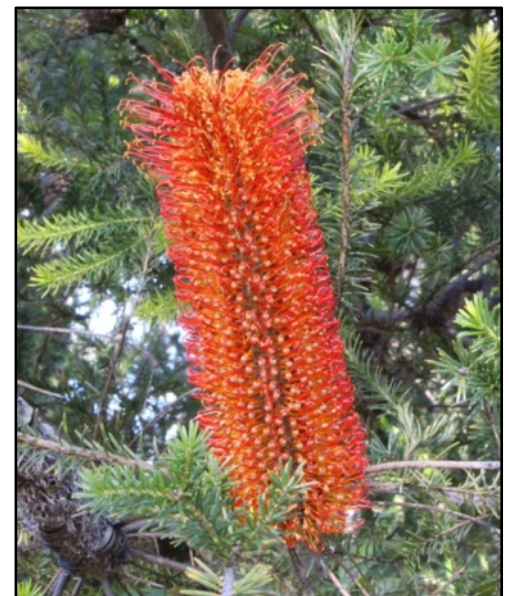
Banksia ericifolia 'Red Clusters', is a small tree with green heath-like foliage and very large orange-red cones.