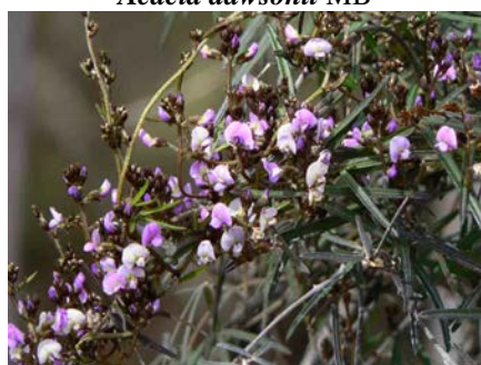
Glycine clandestina JG