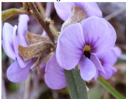
Hovea heterophylla MB