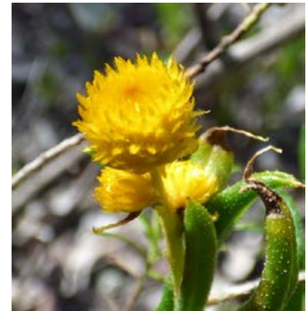
Chrysocephalum apiculatum MB