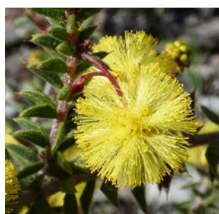
Acacia gunnii MB