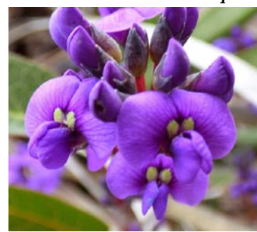
Hardenbergia violacea close-up MB