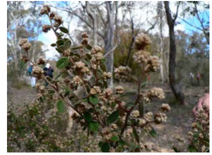
Pomaderris eriocephala JG