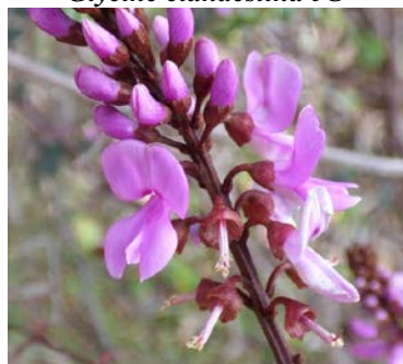
Indigofera australis MB