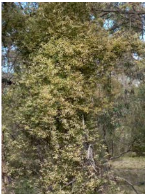
Clematis leptophylla JG