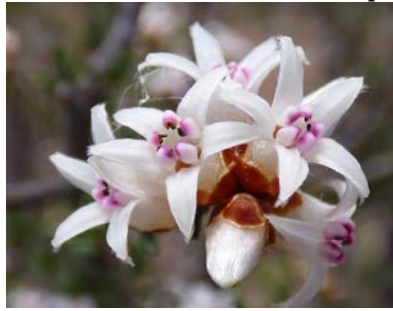
Cryptandra speciosa MB