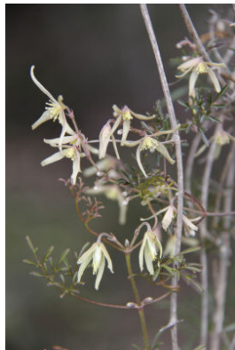
Clematis leptophylla LS