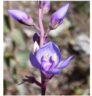
Veronica perfoliata MB