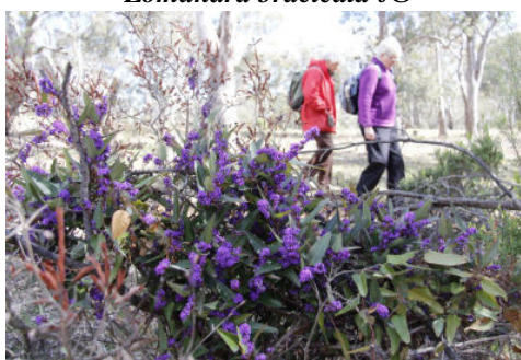
Hardenbergia violacea LS