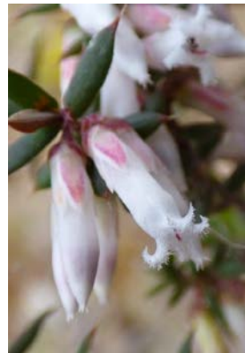
Leucopogon fletcheri ssp. brevisepalus MB