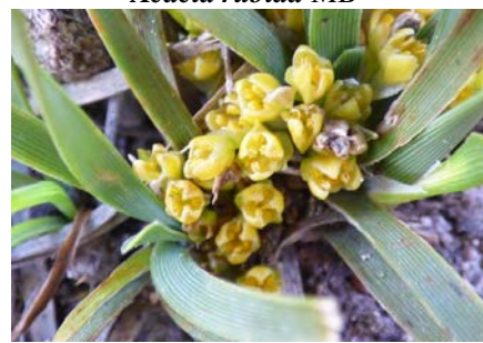
Lomandra bracteata close-up MB