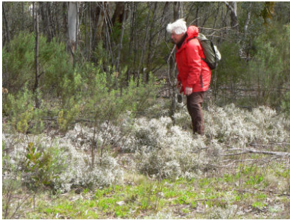
Cryptandra amara JG