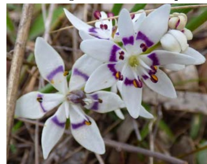
Wurmbea dioica MB