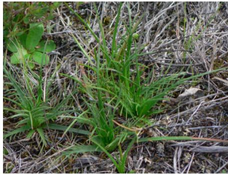
Eryngium ovinum emerging JG