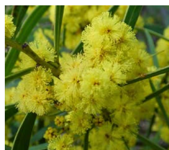
Acacia rubida MB