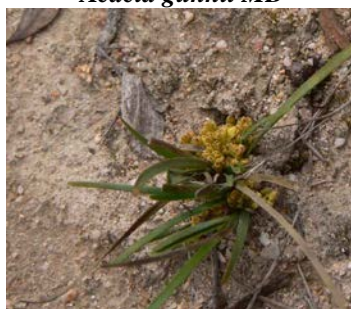
Lomandra bracteata JG