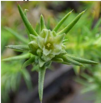
Scleranthus diander MB