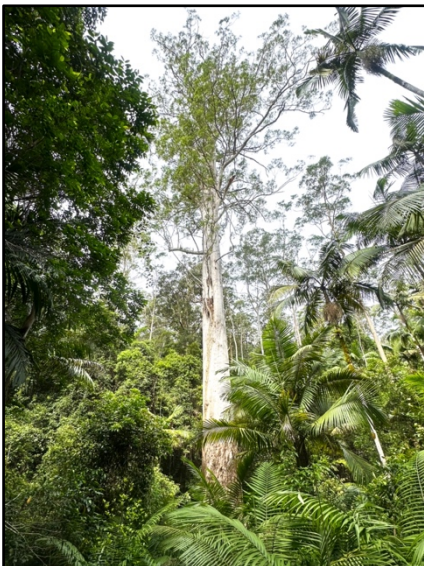
Eucalyptus grandis, Flooded Gum, the largest tree in NSW. It is 400 years old, 76.2m above mean ground level, Myall Lakes National Park.