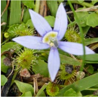
Isotoma fluviatilis & Drosera sp. MB