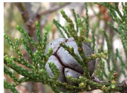
Callitris endlicheri fruit GRK