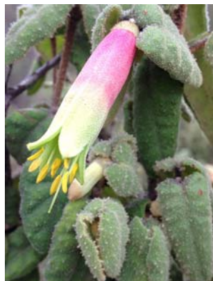
Correa reflexa (red) GRK