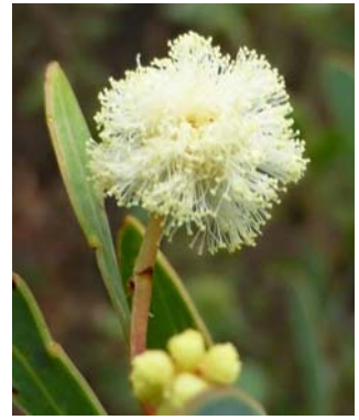
Acacia penninervis MB