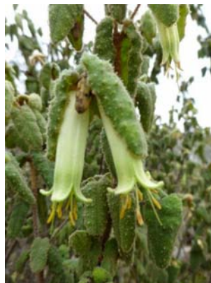
Correa reflexa (green) MB