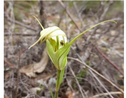
Diplodinium reflexum MB