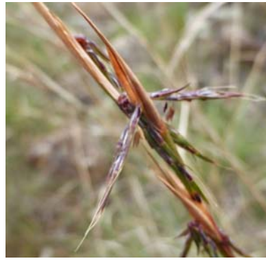
Cymbopogon refractus MB