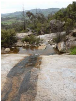
Cypress Pine Walk MB