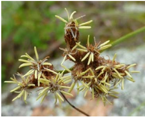
Fimbristylis dichotoma MB