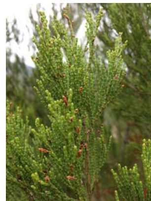
Callitris endlicheri GRK