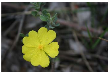
Hibbertia obtusifolia GRK