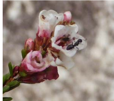
Micromyrtus ciliata MB