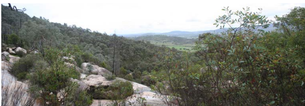
View from Cypress Pine Lookout GRK

For the images below: GRK = Gail Ritchie Knight, MB = Martin Butterfield