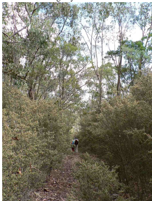
Pomaderris eriocephala lining the track