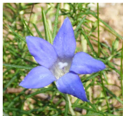
Wahlenbergia ? communis