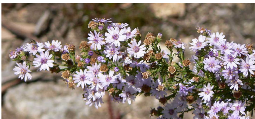
Un-named Olearia species