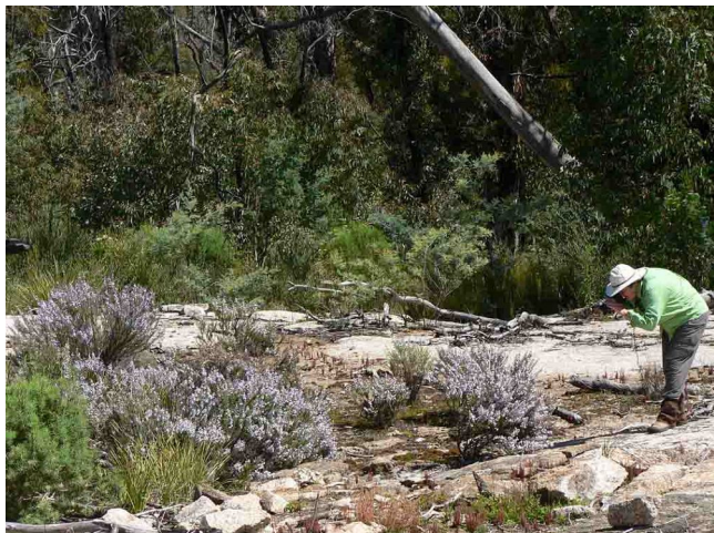
Un-named Olearia species

This walk is part of the Australian Alps Walking Track. The vegetation is regenerating from the 2003 bushfires and is woodland with some swampy areas. There are many striking, large granite boulders, with one such area surrounded by an olearia which is in the process of being named. There is a diverse array of understorey plants including brilliant displays of Wahlenbergia gloriosa and Lobelia dentata (both deep purple) in February. Olearia glandulosa was also flowering – a plant not often seen by us.