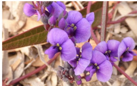
Hardenbergia violacea MB