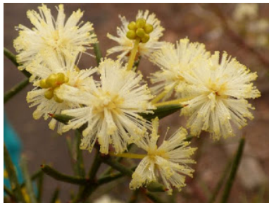
Acacia genistifolia MB