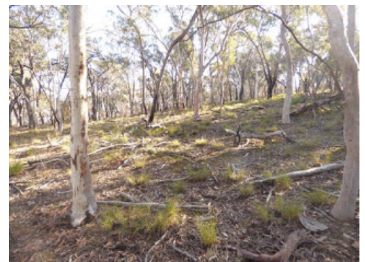
Recovery after a control burn MB