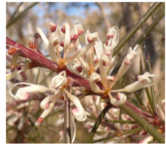
Hakea decurrens MB