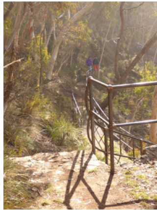
Circuit Track MB