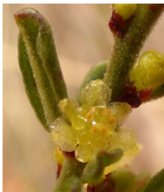
Phyllanthus hirtellus MB