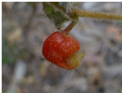
Grevillea alpina RF