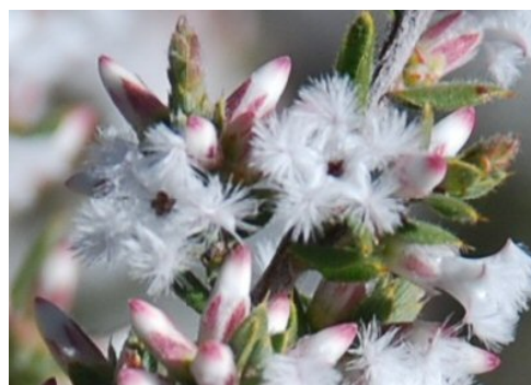
Leucopogon attenuatus close up