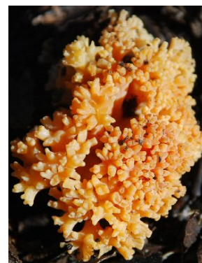
A coral fungus