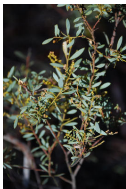
Acacia buxifolia in bud