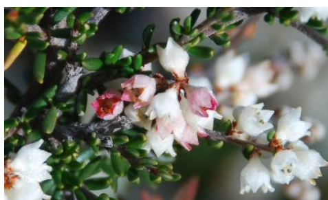
Cryptandra amara var. floribunda