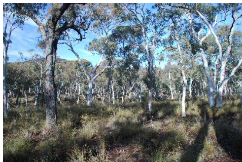
Eucalyptus rossii and E. macrorhyncha