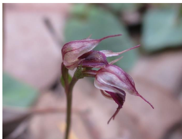
Acianthus collinus (KN)