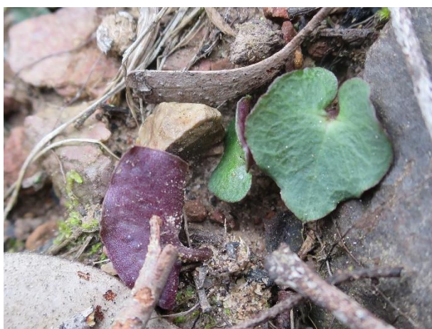
Acianthus excertus with purple under-leaf (KN)