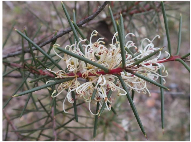
Hakea decurrens (KN)