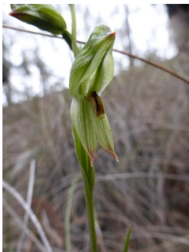
Bunochilus umbrinus (JJ)