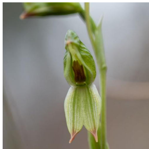
Bunochilus umbrinus "flipped" (SN)