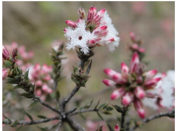
Leucopogon attenuatus (KN)