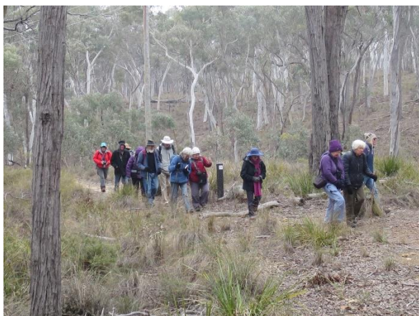
Starting out (KN)