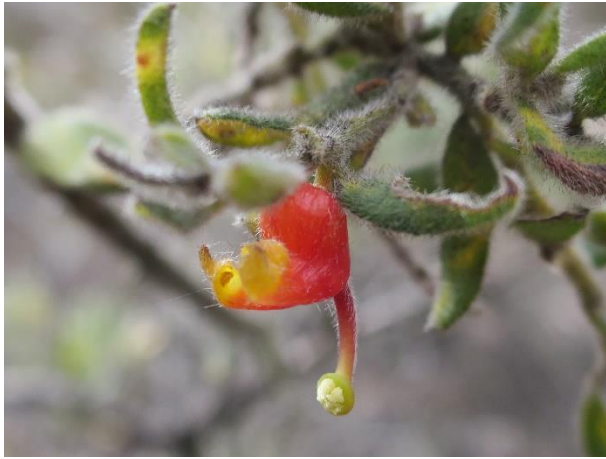
Grevillea alpina (KN)