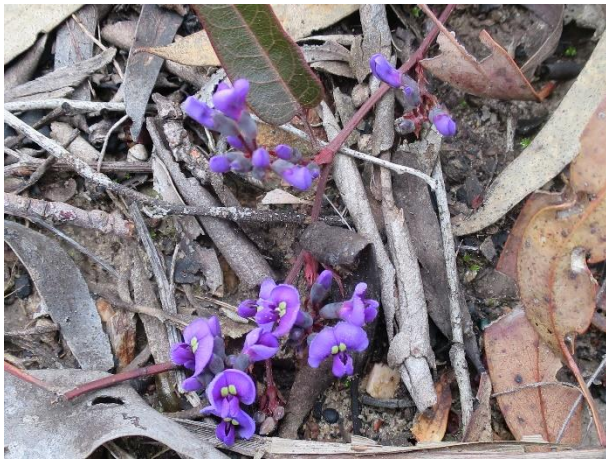
Hardenbergia violacea (KN)