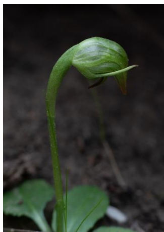
Pterostylis nutans (SN)