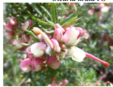
Grevillea lanigera RF