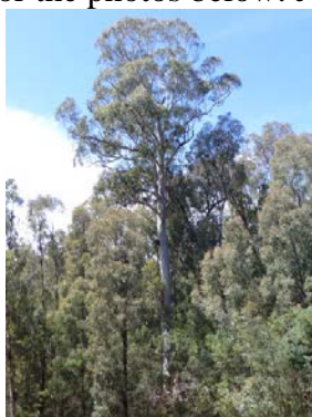
Eucalyptus dalrympleana RF

For the photos below: JG = Jean Geue, RF = Roger Farrow