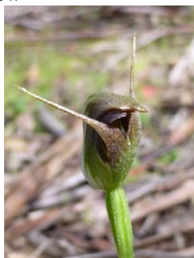
Pterostylis pedunculata RF