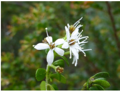
Leionema lamprophyllum RF