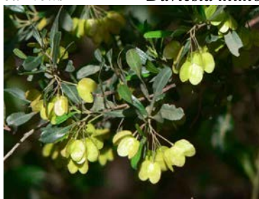
Dodonaea viscosa JG