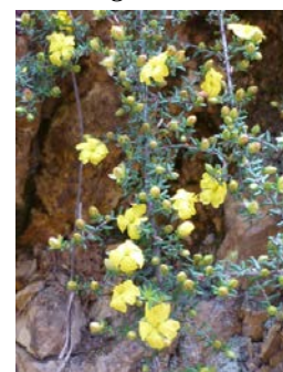
Hibbertia serpyllifolia RF