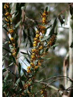
Daviesia mimosoides