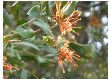
Grevillea oxyantha ssp. oxyantha RF