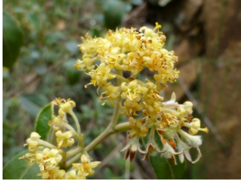
Pomaderris ? intermedia RF