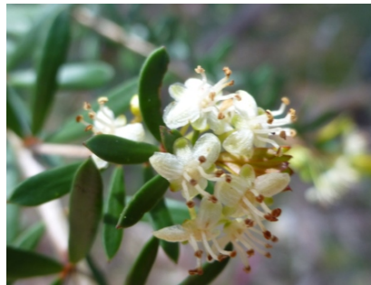
Micrantheum hexandrum RF