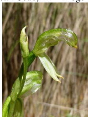
Bunochilus montanus RF