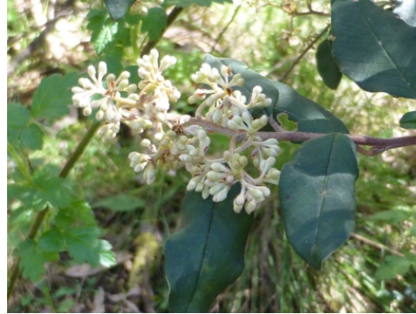
Pomaderris costata RF