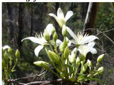
Clematis aristata RF