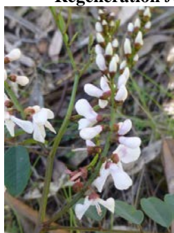
White Indigofera australis RF