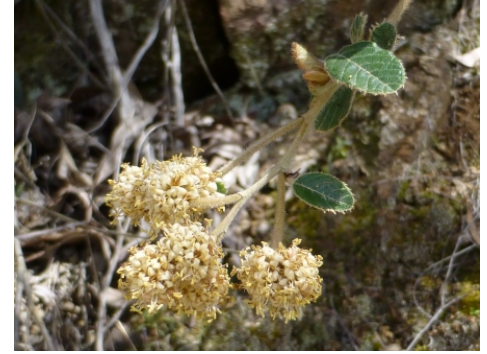
Pomaderris eriocephala RF