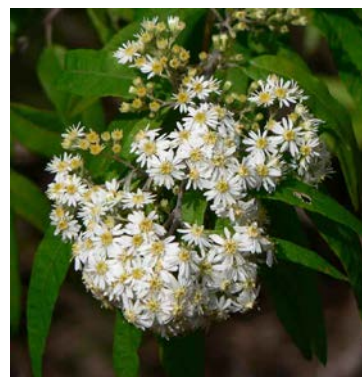
Olearia lirata