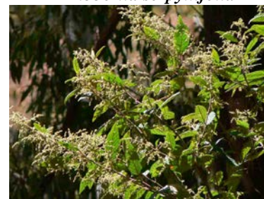
Pomaderris aspera JG