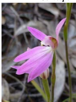
Petalochilus carneus RF