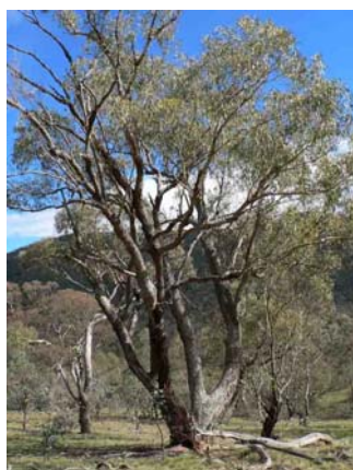
Eucalyptus bridgesiana

For the photos below: GRK = Gail Ritchie-Knight, = Jean Geue, RF = Roger Farrow