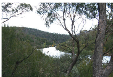
Murrumbidgee River GRK