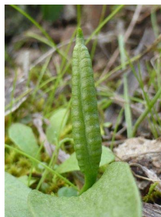
Ophioglossum lusitanicum RF