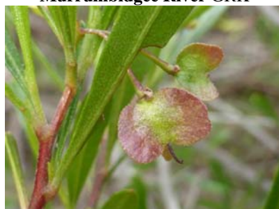
Dodonaea viscosa ssp. angustissima RF