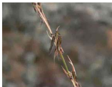
Cymbopogon refractus JG