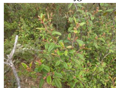
Pomaderris ? prunifolia RF