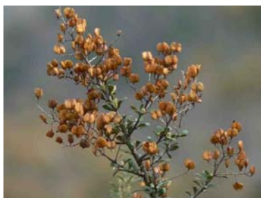
Bursaria spinosa fruit JG