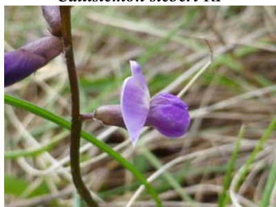
Glycine tabacina RF