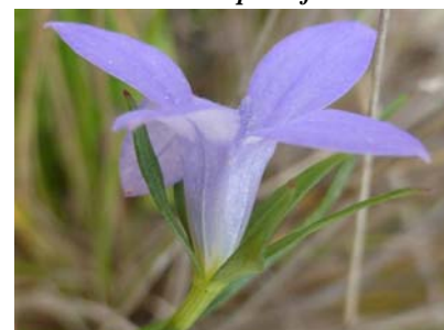
Wahlenbergia sp. RF