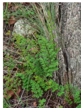
Cheilanthes austrotenuifolia JG