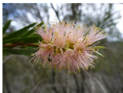
Callistemon sieberi RF