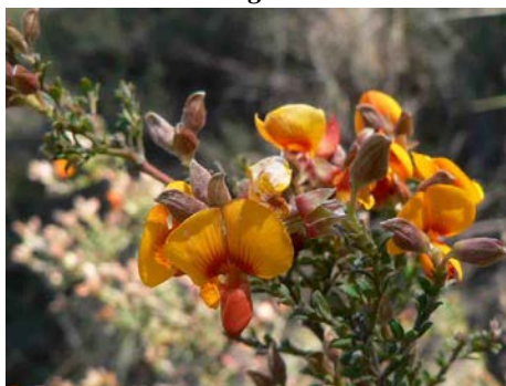
Mirbelia oxylobioides JG