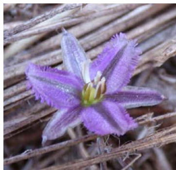
Thysanotus patersonii MB