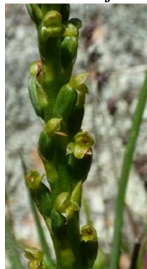
Microtis parviflora MB