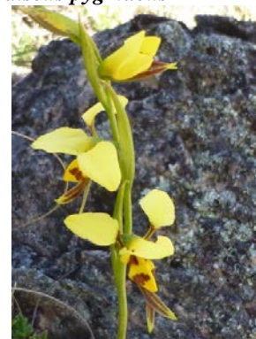
Diuris sulphurea RF