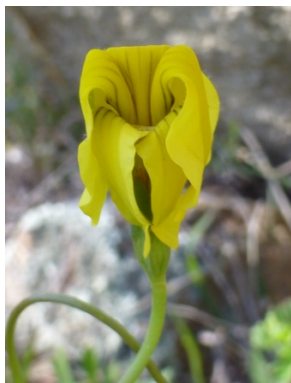
Goodenia pinnatifida RF