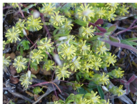
Triptilodiscus pygmaeus RF