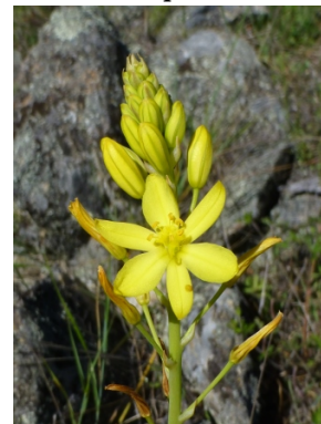
Bulbine glauca RF