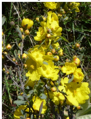
Hibbertia obtusifolia RF