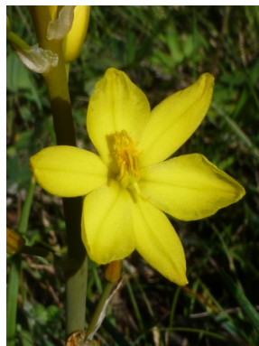
Bulbine bulbosa RF