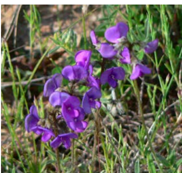
Swainsona sericea JG