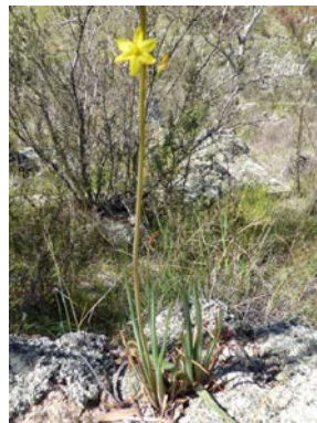
Bulbine glauca MB