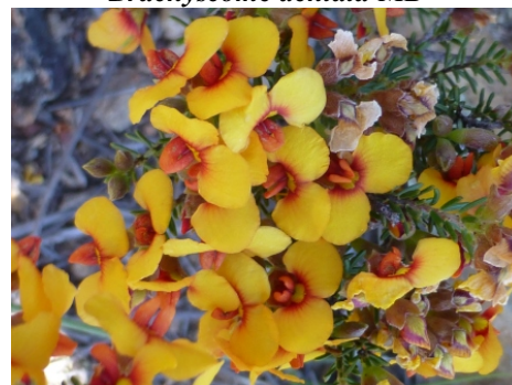
Dillwynia sericea RF