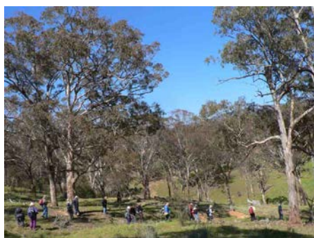
Open woodland