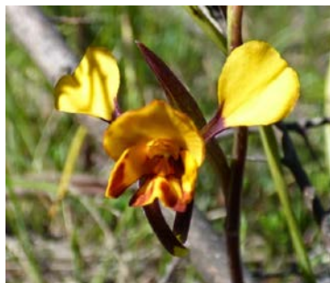
Diuris semilunulata MB