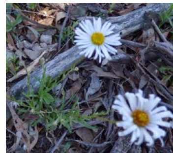
Brachyscome dentata MB