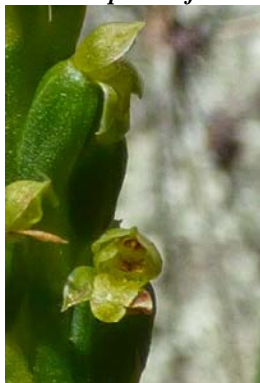
Microtis parviflora MB